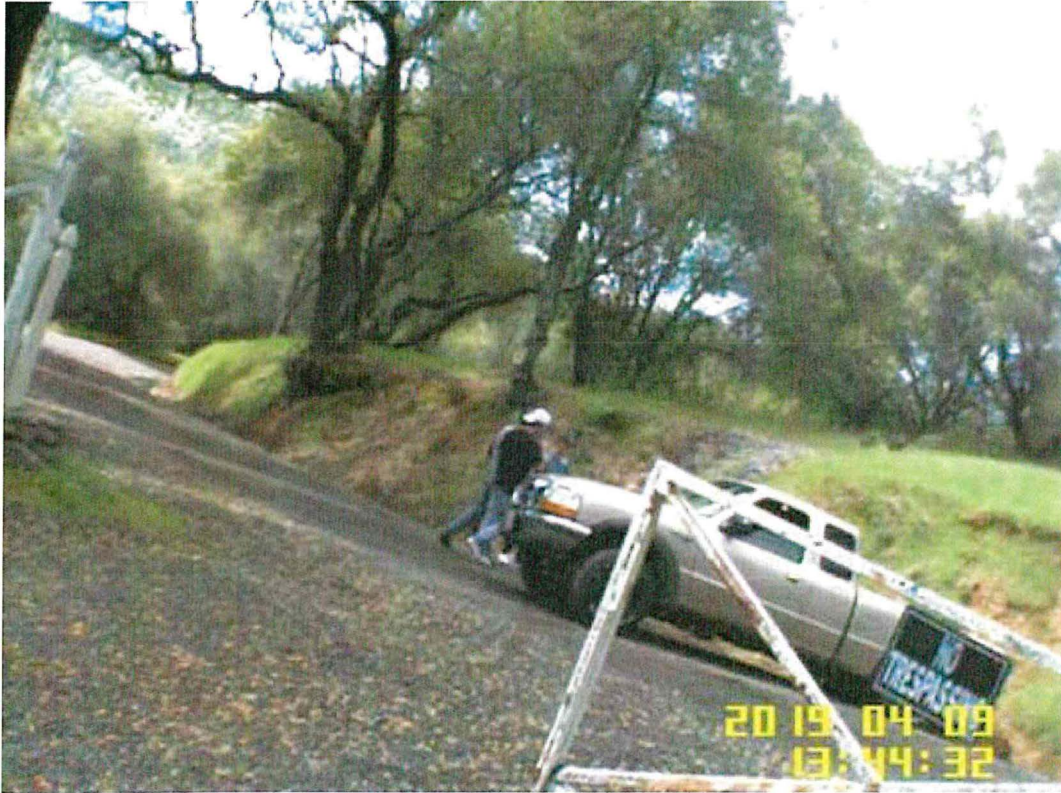
Mt. Murphy Road near Carvers Road: