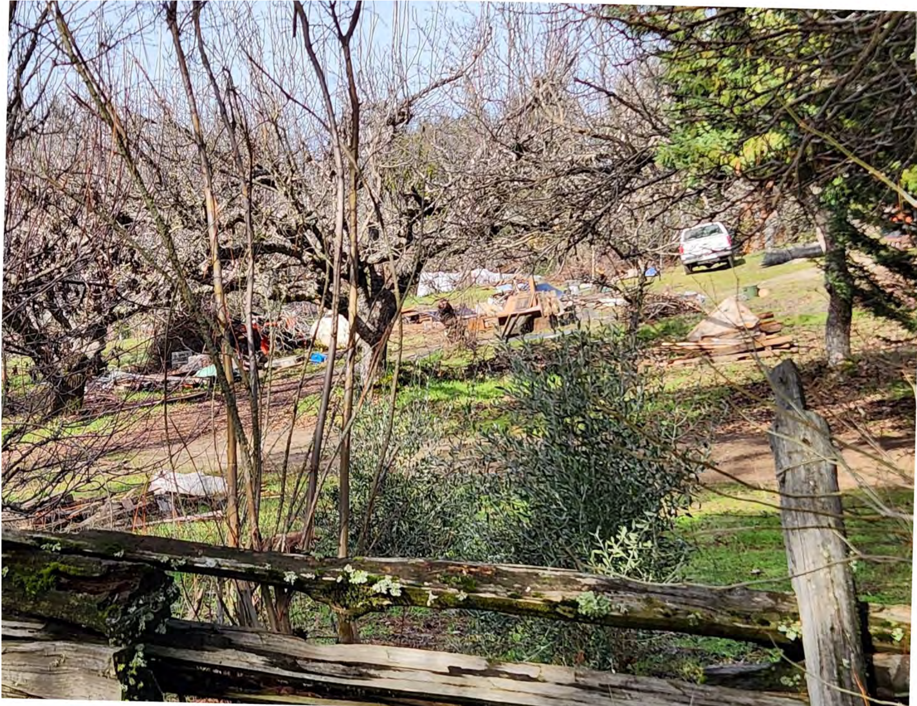
24-0114 Public Comment PC Rcvd 01-18-24