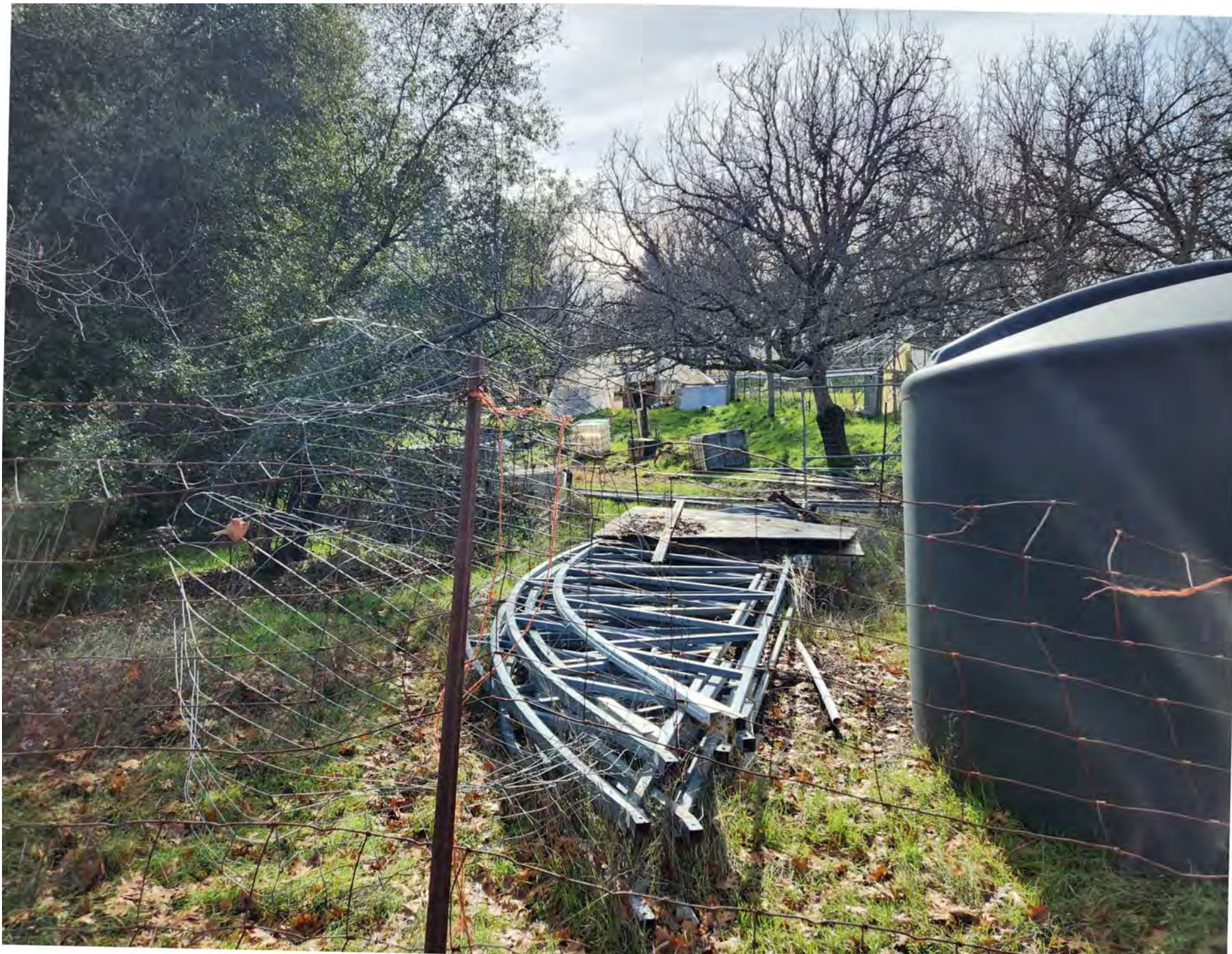
24-0114 Public Comment PC Rcvd 01-18-24