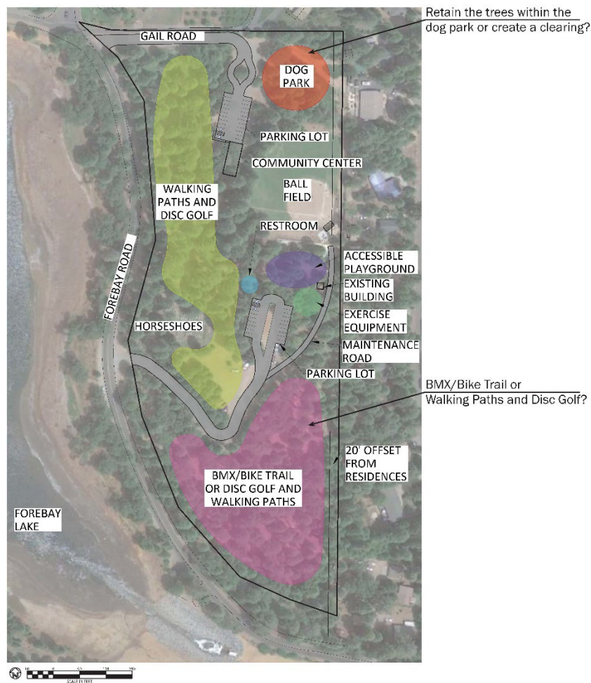
Figure 1 – Forebay Park Draft Conceptual Design