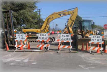
Permits / Inspection