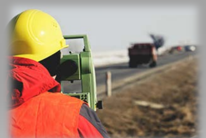
ROW / Survey