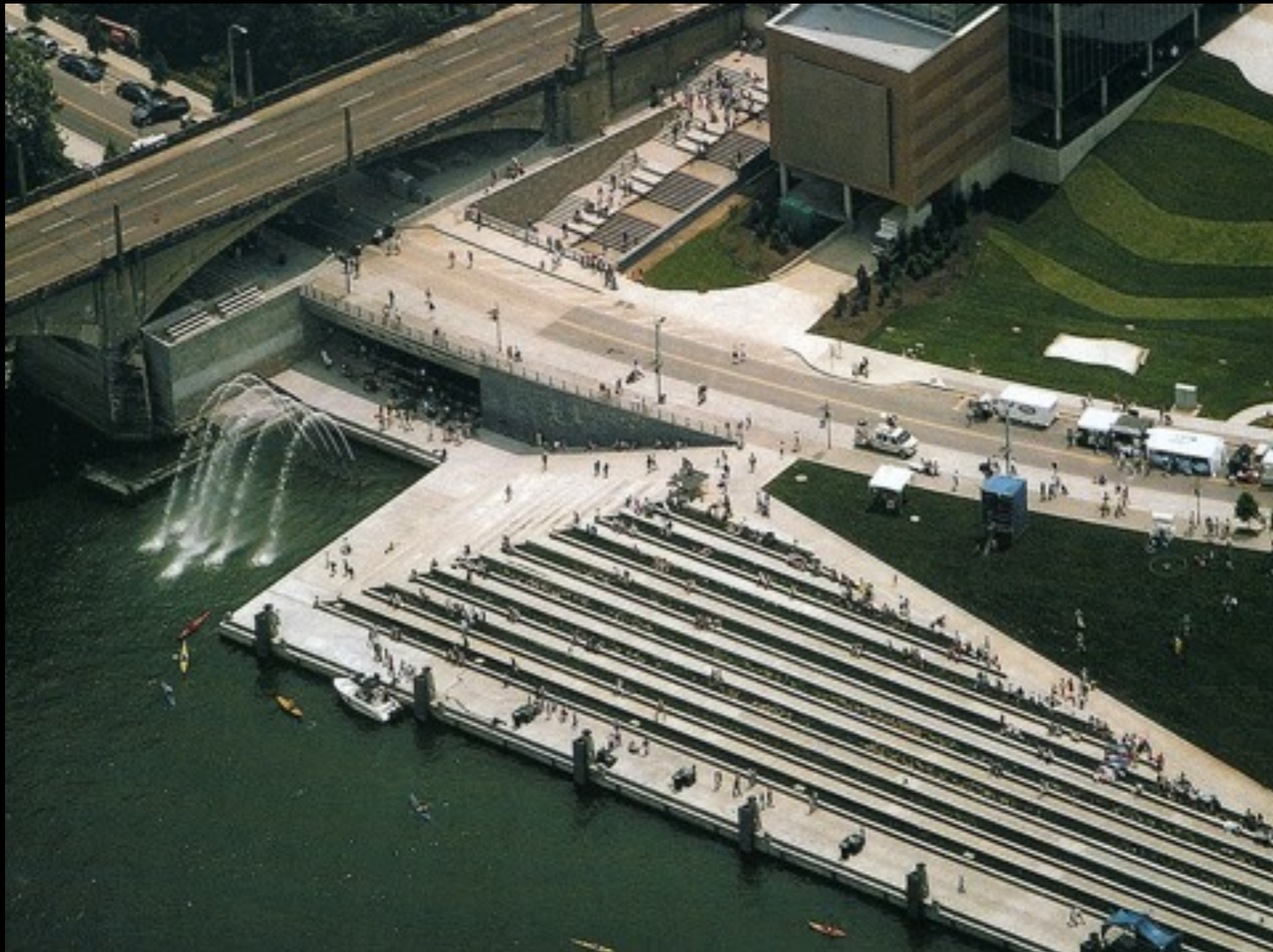
2005 Waterfront Park