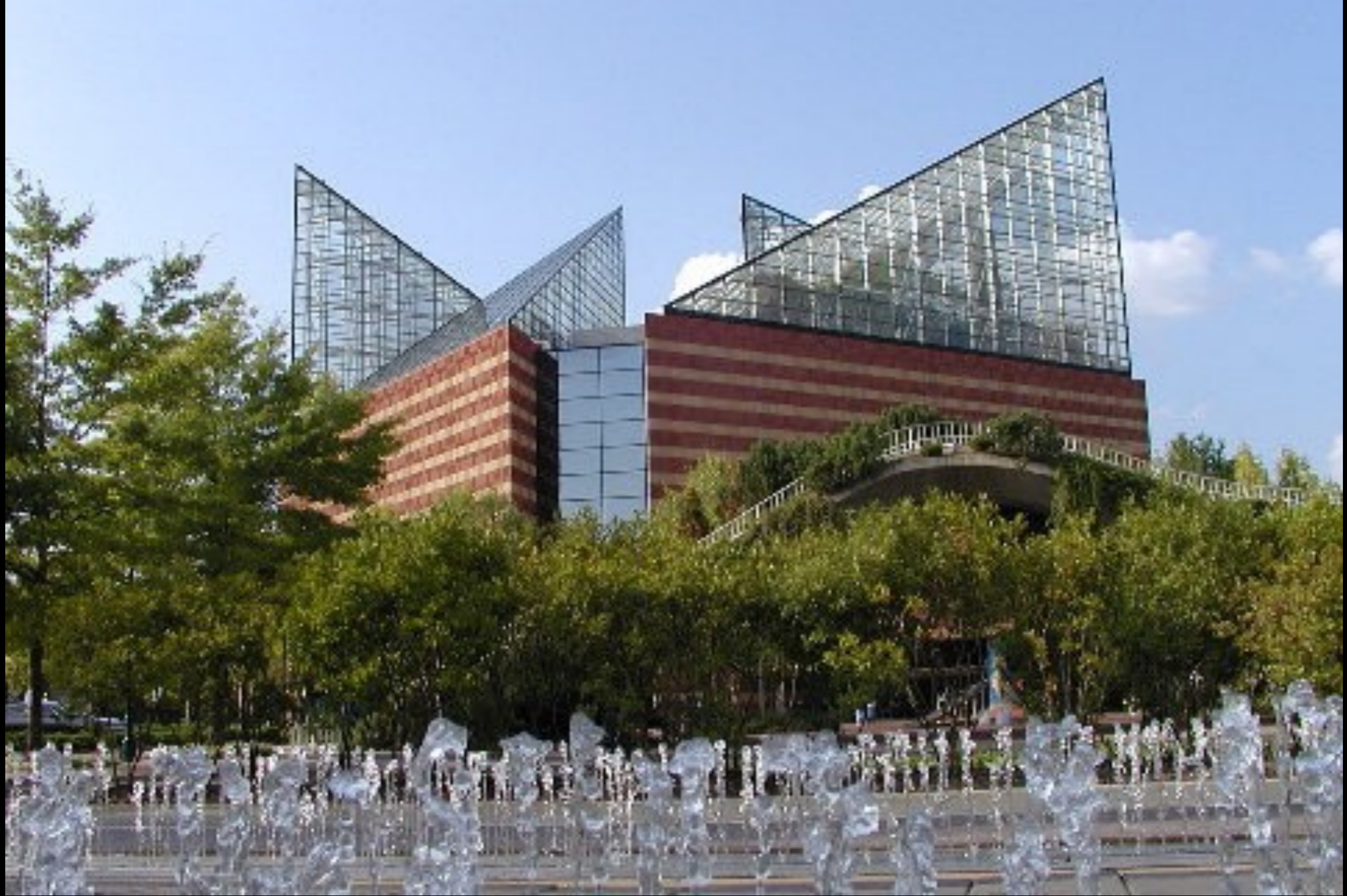
1992 Tennessee Aquarium