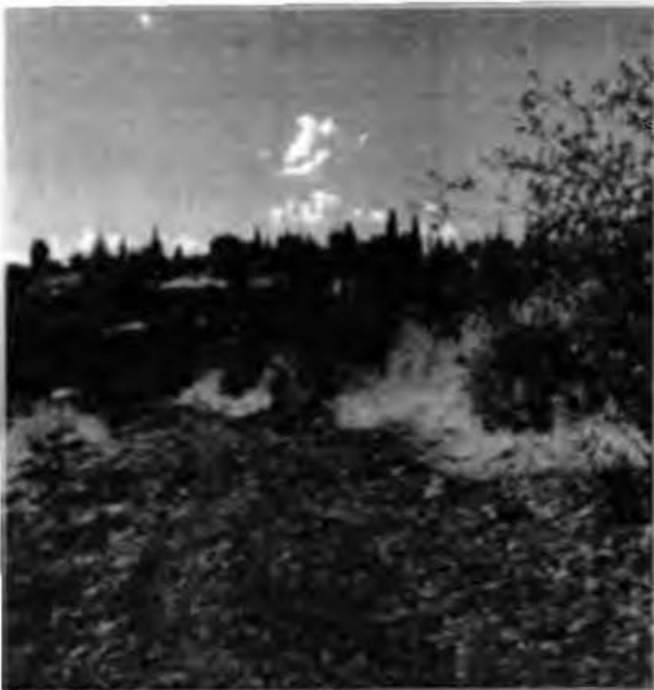
Figure 2 – A bull-dozed fire line defines the northern, eastern and southern edges of the site.