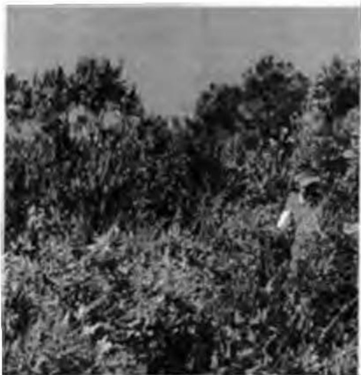
Figure 3 – Surveyors walked the site in a zig zag pattern except where prohibited by the presence of a dense barrier of shrubby vegetation.