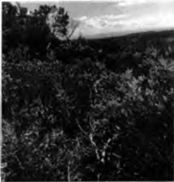
Figure 1 – The Sierra Sunrise Site is occupied by a dense stand of old growth chamise and white-leaf manzanita with scattered interior live oaks and grey pine.