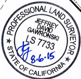
Exhibit A - Site Plan