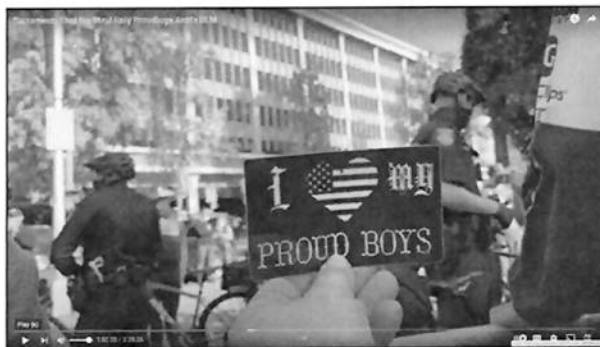
Figure 11 Block’s Proud Boys stickers