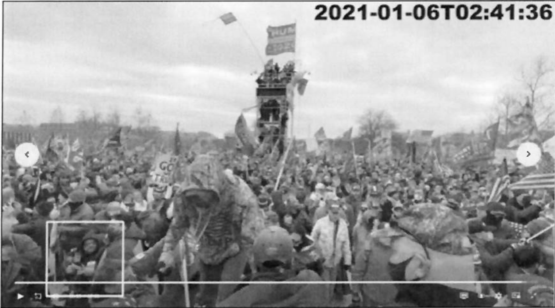
Figure 16 Proud Boy Eddie Block - Lower West Terrace, U.S. Capitol - January 6, 2021