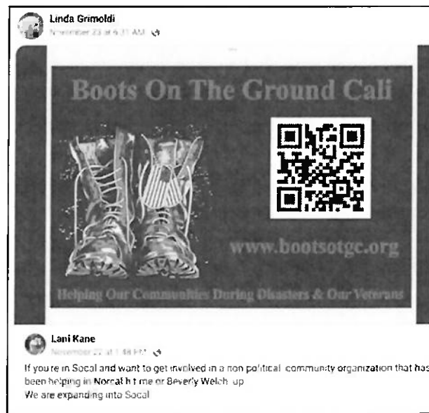
Figure 25 Grimoldi’s promotion of BOTGC’s Southern California expansion