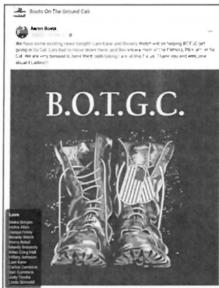
Figure 24 BOTGC expansion to Southern California “Patriots” and “PB’s etc.”