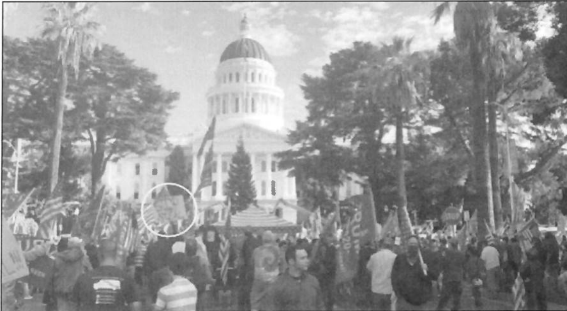
Figure 5 “Stop the Steal” Rally - California State Capitol - November 7, 2020

The end result of the “Stop the Steal” campaign was the January 6, 2021 attack on the U.S. Capitol, led by the Proud Boys. Compare, for example, the first lawful rally in Sacramento on November 7, 2020, and the final unlawful attack in Washington D.C. on January 6, 2021. (See Figures 5-6.)