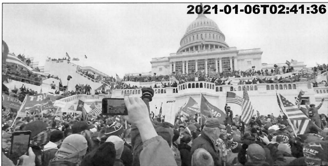
Figure 6 “Stop the Steal” Attack - U.S. Capitol - January 6, 2021