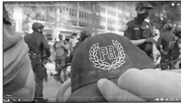
Figure 12 Block’s Proud Boys ball cap