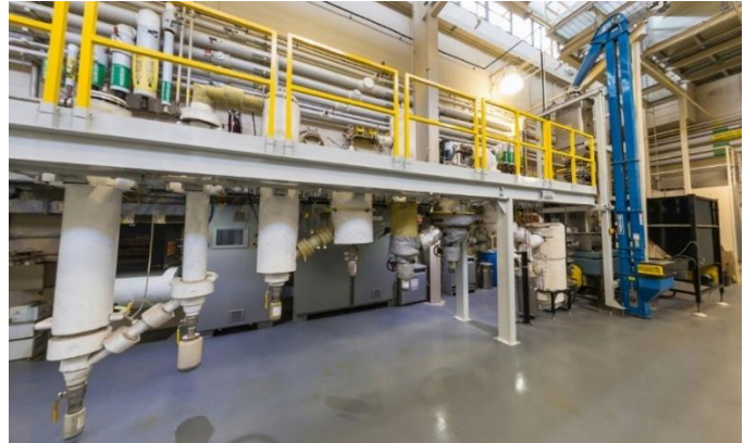
ISU's pilot pyrolysis system, used to convert agricultural residues to bio-oil.

To scale-up and manufacture the system, experts from Easy Energy Systems (EES) will use a modular approach that will enable systems to be easily scaled to meet the needs of future users. Sierra Pacific Industries (SPI) will host the technology demonstration at a sawmill in Northern California, enabling the team to evaluate results and chart a pathway to commercialization.