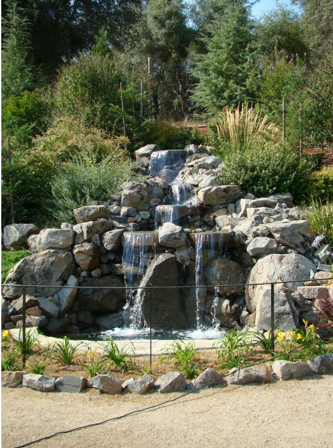
Waterfall at Wine Club Terrace