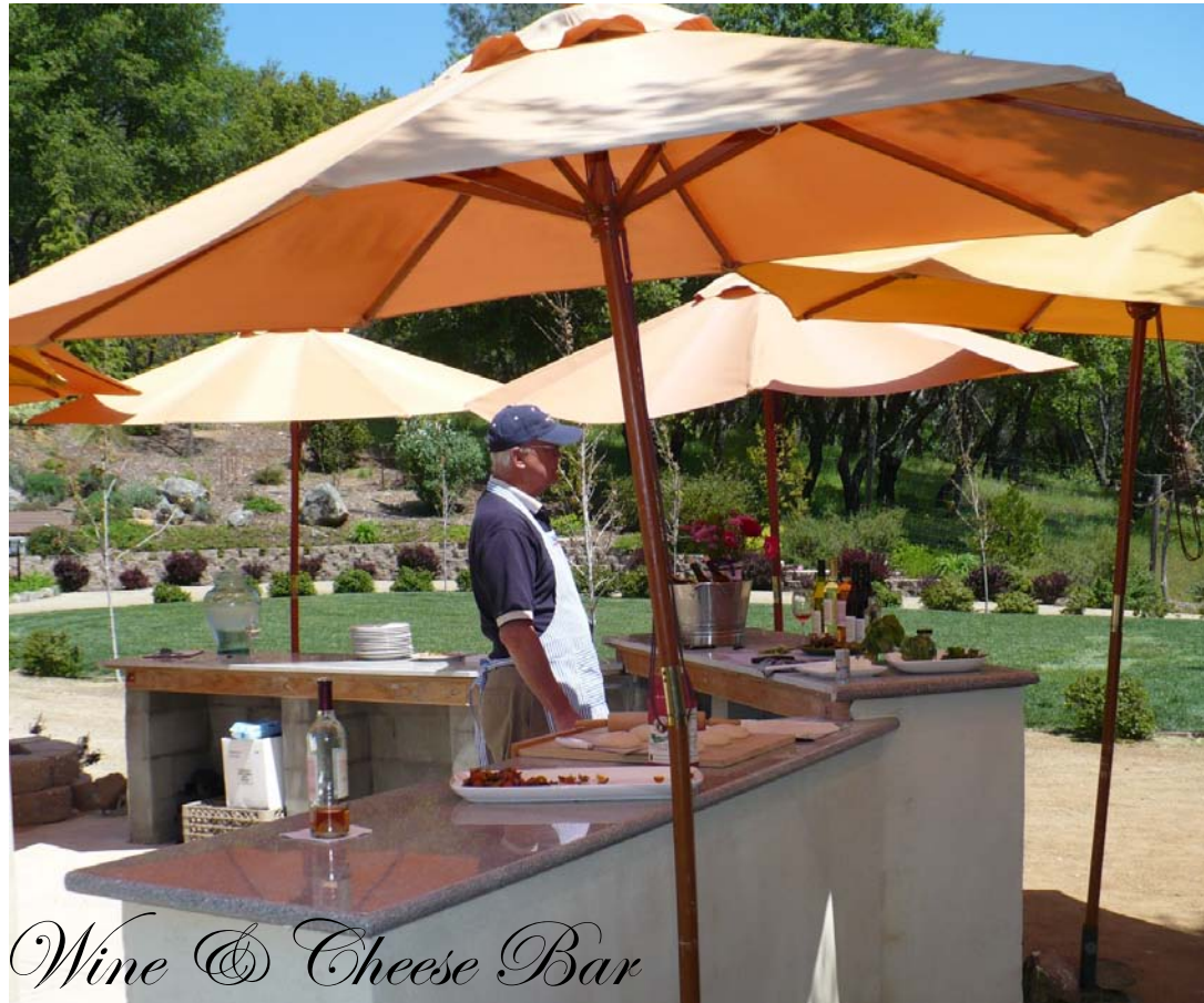
Wine & Cheese Bar