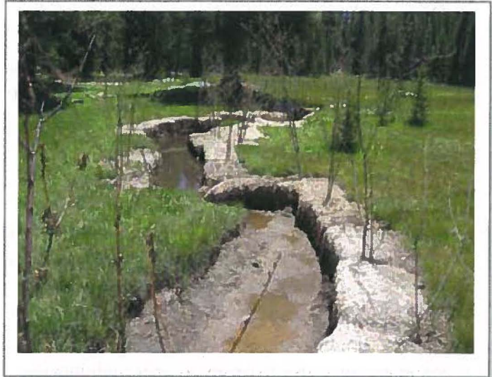
Loggy Meadow Restoration Project on the Sequoia National Forest. The project stabilized stream banks and allowed the stream to access its flood plain, returning the area to a more natural condition.