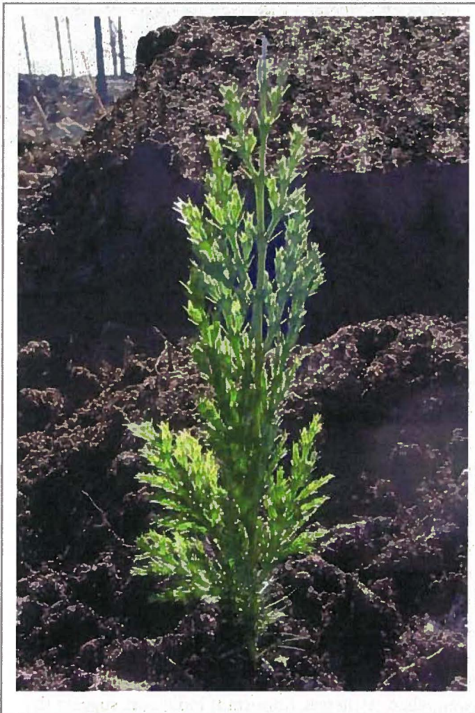
Seedling planted after a wildfire, Lassen National Forest.

time. Wildland fires in California are becoming larger and more frequent. Of greatest concern is a notable increase in the area of forestland burning at high severity over the last quarter-century. Fire exclusion over many decades, in conjunction with other forest management choices, has resulted in dense, middle-aged forests over large areas of California. These forests are highly susceptible to severe wildfire, which fragments forests, emits carbon, increases erosion rates and sedimentation, negatively affects water quality and delivery, and damages old-growth forest habitats that sustain important components of the Region's biodiversity. Dense middle-aged forests are also more susceptible to drought stress, large-scale insect outbreaks and disease epidemics.