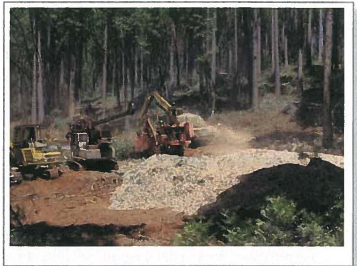
A wood chipper processes woody biomass from a restoration thinning project, Mt Hope Stewardship Project, Plumas National Forest.