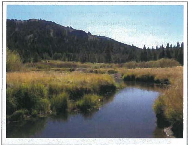
Meadow restoration in the Tahoe National Forest

Ecosystem services are the goods and services that flow from wildlands and forests that are valued and used by people, and that directly or indirectly support human well-being. Wildlands and forests are valued for basic goods, such as wood, fiber, and water, but these ecosystems also deliver important services that are perceived to be free or limitless such as air and water purification, flood and climate regulation, biodiversity, scenic landscapes, wildlife habitat, and carbon sequestration and storage. The National Forests are important providers of ecosystem services to humans and to other inhabitants of our wildlands as well. Our commitment to restoration-based manage-