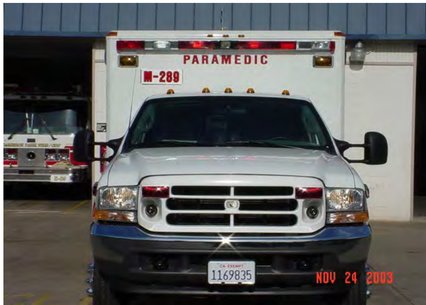
Figure 4 – Front View

The word Paramedic is centered on the front of the patient cabin. The top of the letters is 2 \frac{1}{8} inches from the bottom of the light bar. The letters are 4 inch red reflective with \frac{1}{4} inch pin stripe around each letter.