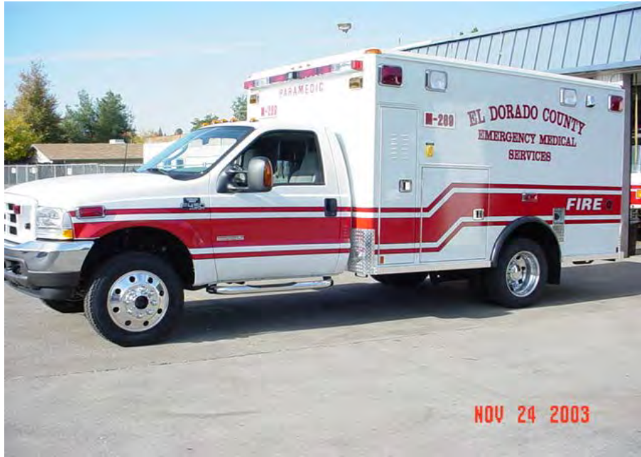
Figure 1 – Driver's Side View