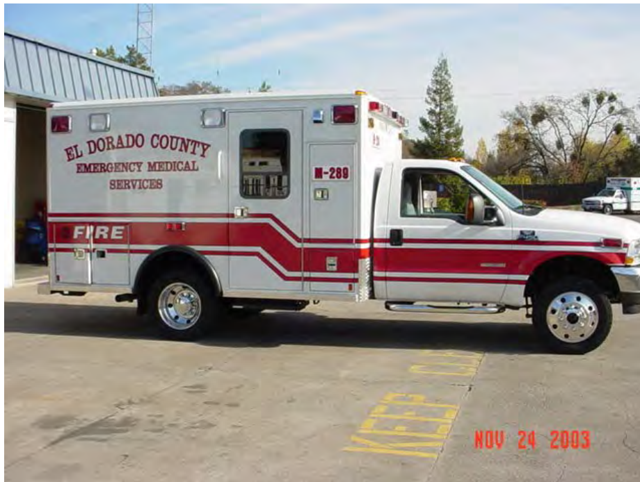
Figure 2 – Passenger Side View