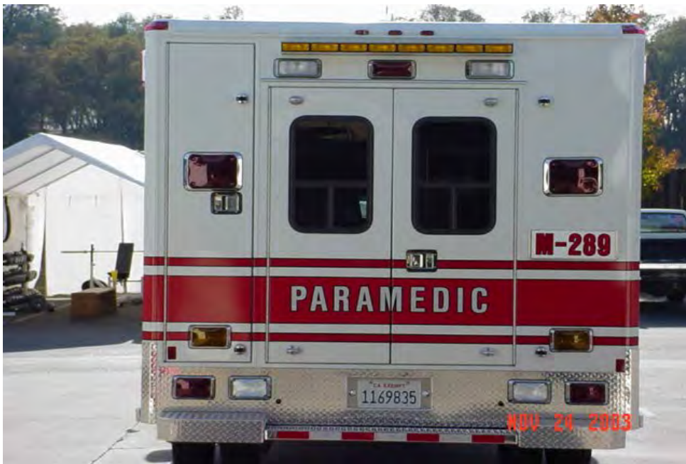
Figure 3 – Rear View

The word Paramedic is centered on the patient cabin. The top of the letters is 2 1/8 inches from the bottom of the light bar. The letters are 4 inch white reflective with ¼ inch pin stripe around each letter.