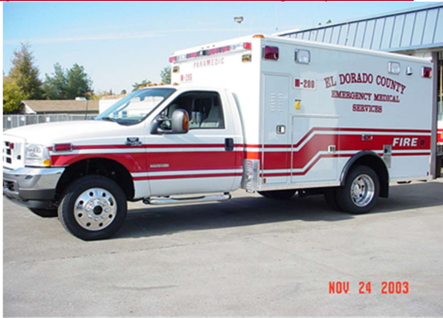
Figure 1 – Driver's Side View