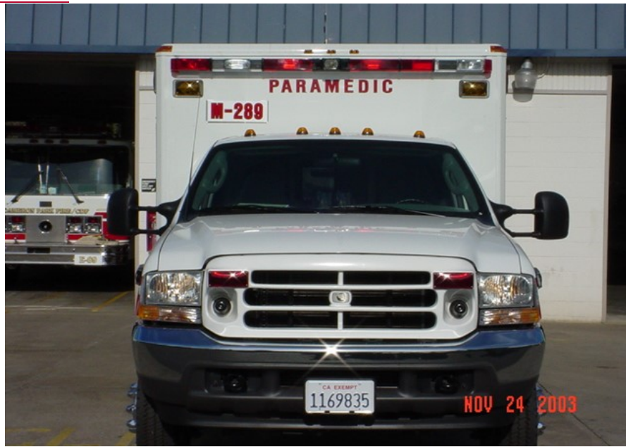
Figure 4 – Front View

The word Paramedic is centered on the front of the patient cabin. The top of the letters is 2 1/8 inches from the bottom of the light bar. The letters are 4 inch red reflective with 1/4 inch pin stripe around each letter.