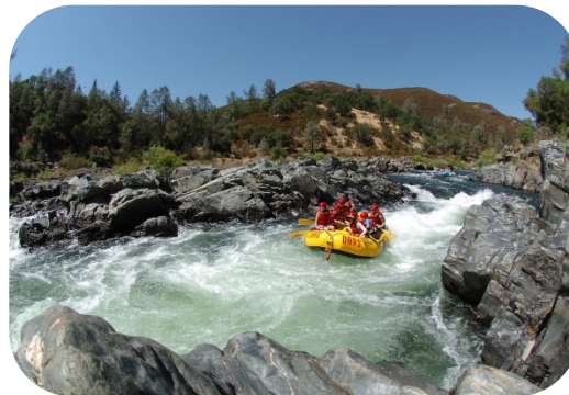
Diversify Employee Duties/Skills