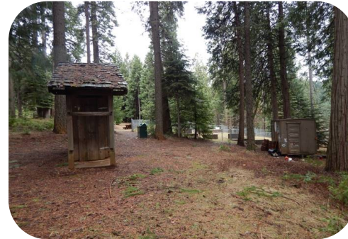
Prop 68 Round 4- Forebay Park Improvements