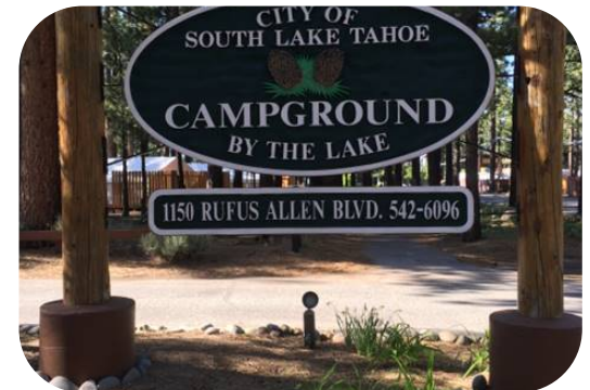
Advise on Current Projects