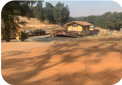
Prop 68 Per Capita Funding