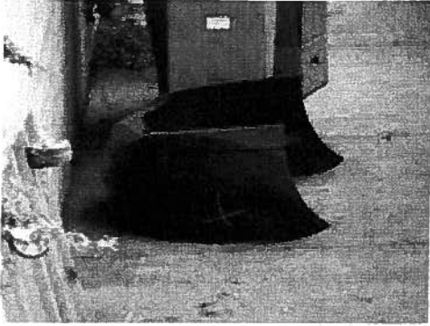
Close up of part 2.JPG 303K