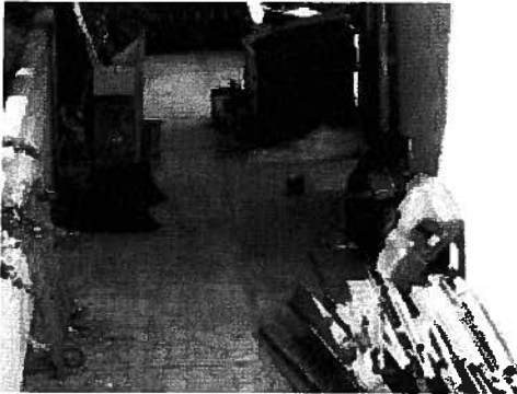
Parts stored outside.JPG 327K