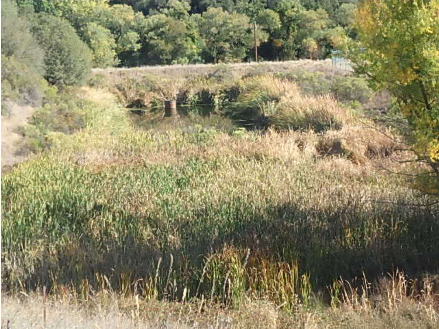
North sedimentation basin.