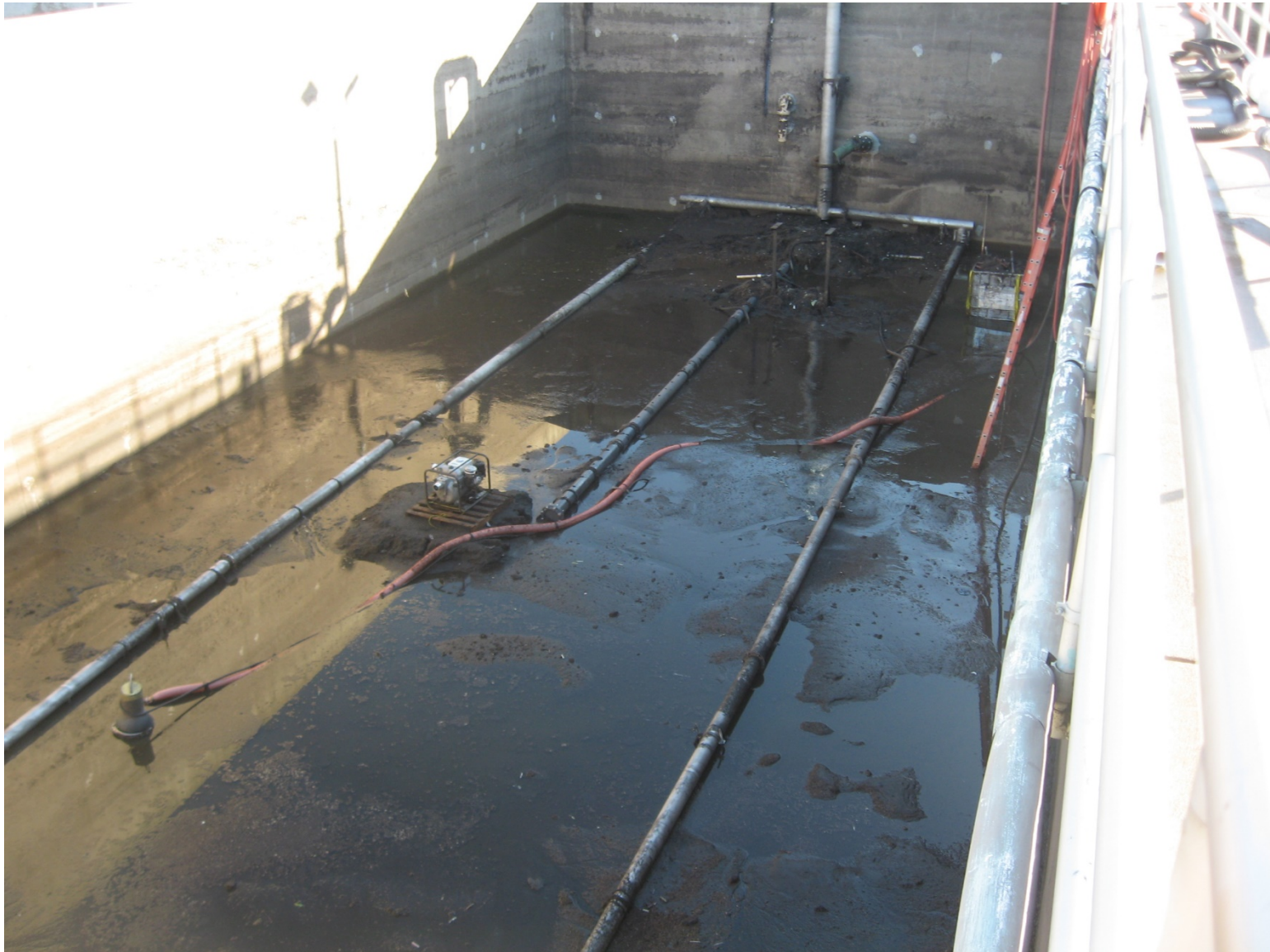
Current digester mostly cleaned. Flat floor.