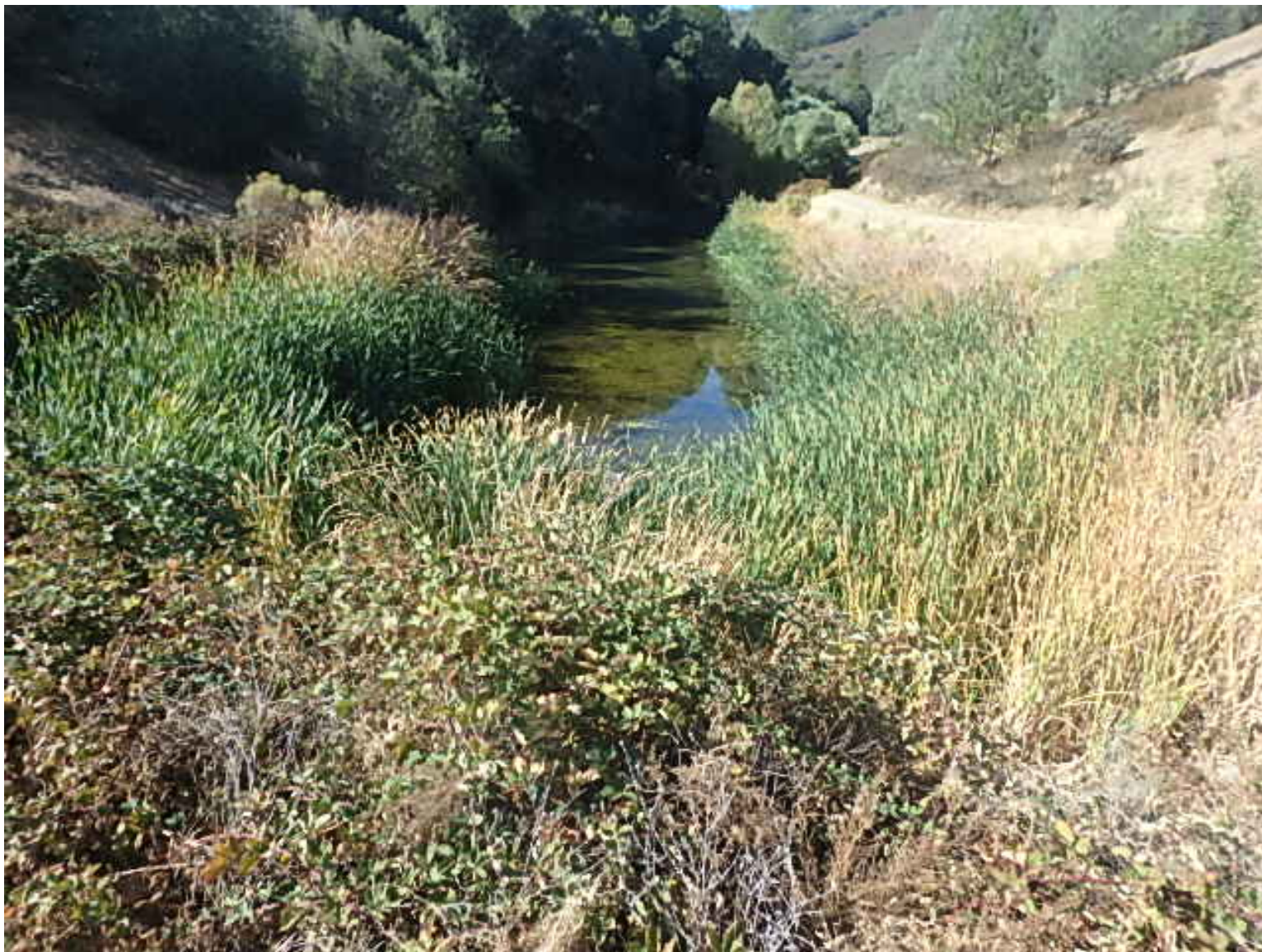
West sedimentation basin.