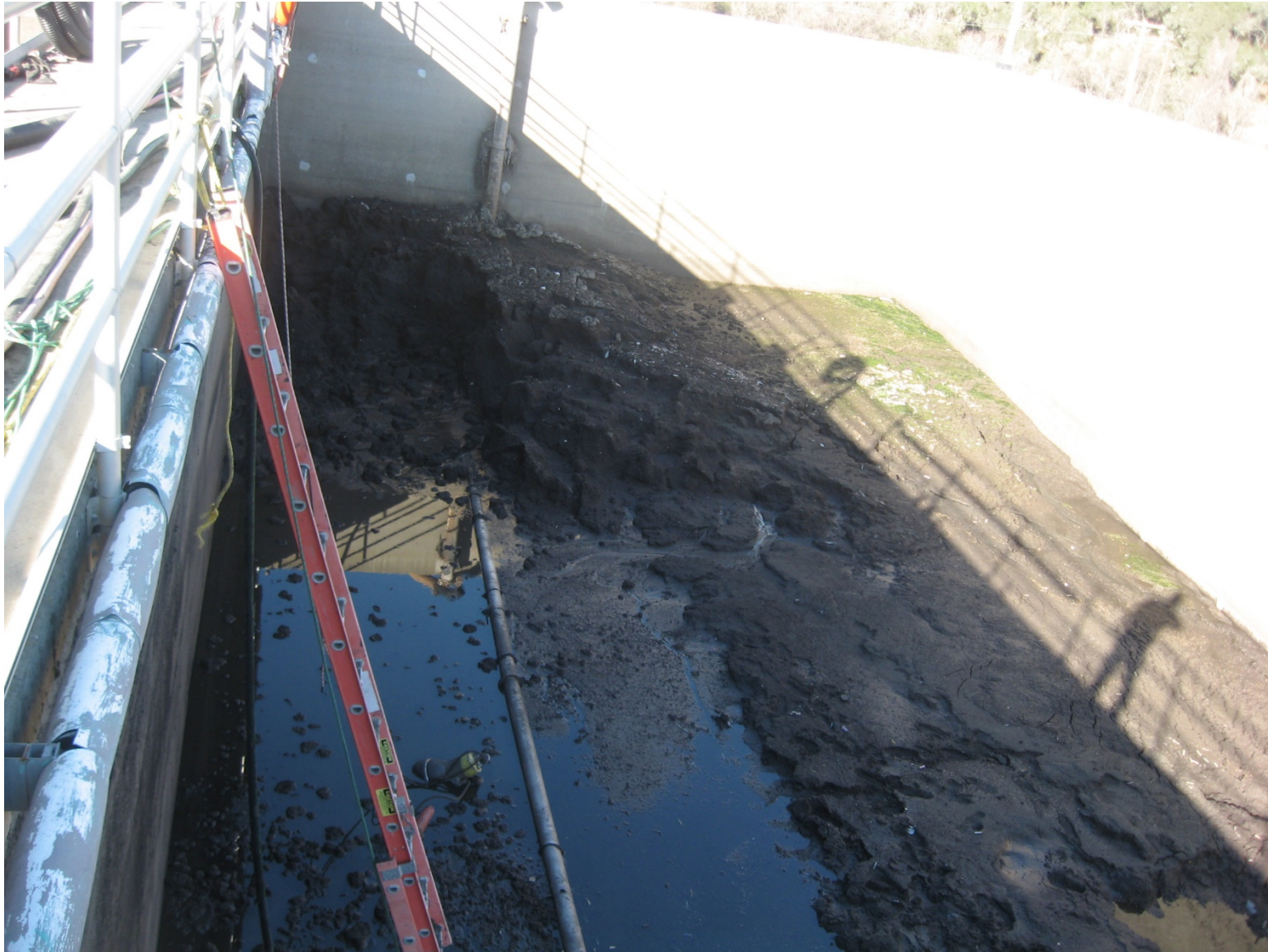
Current digester with excessive solids build up.