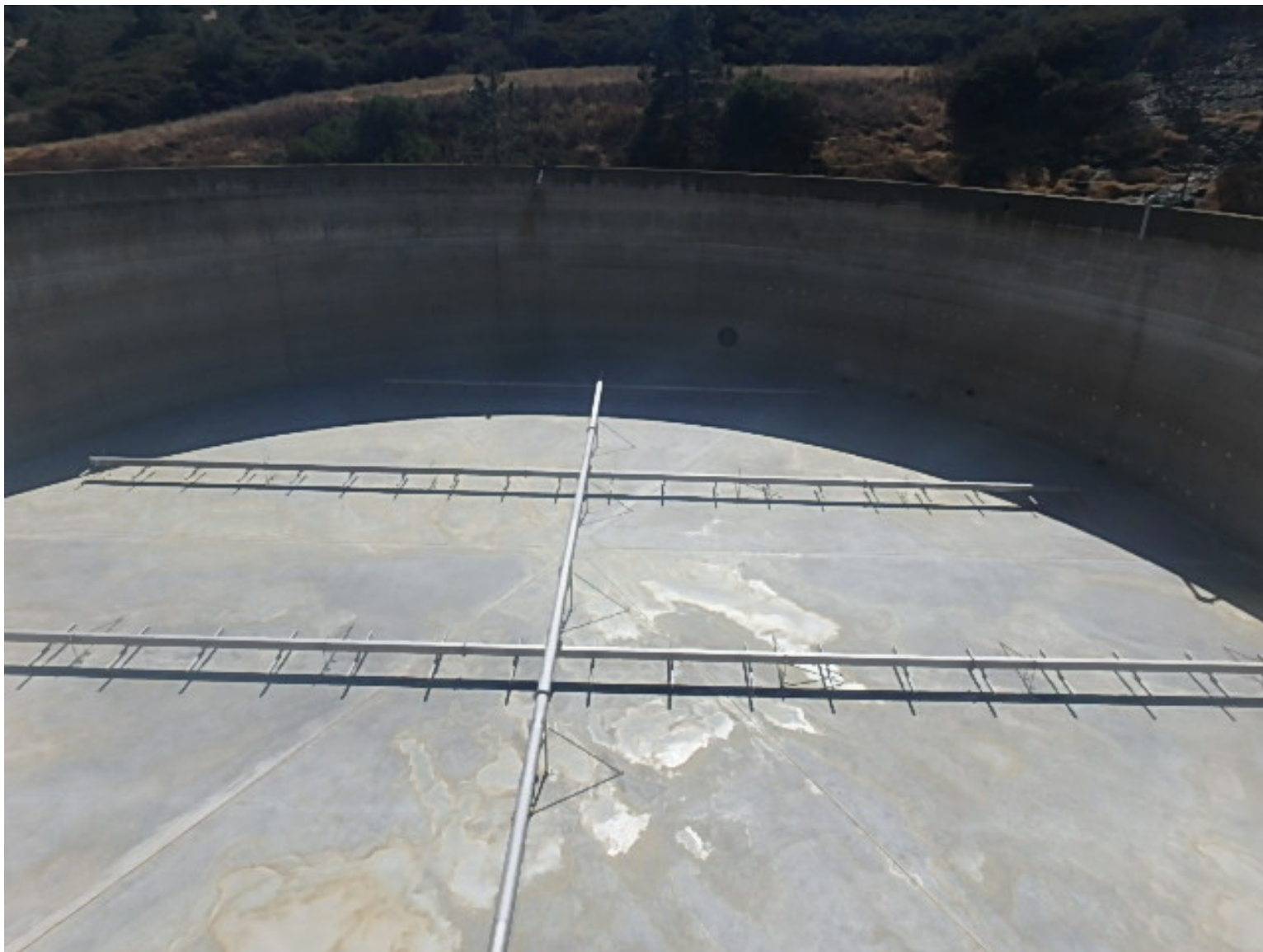
Current 2-million gallon effluent (treated water) storage tank.