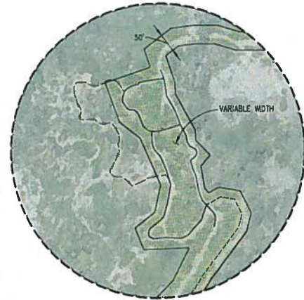
DETAIL A (VICINITY OF POSTPILE) SCALE: 1"=100'