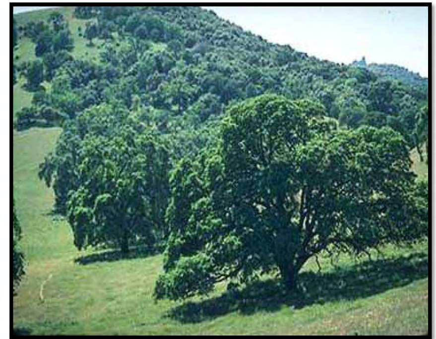
Valley Oak Woodland