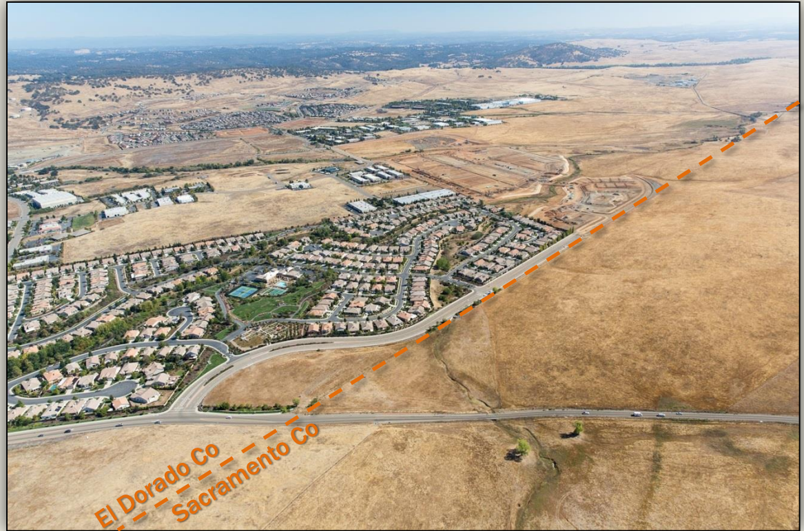
County Line looking South