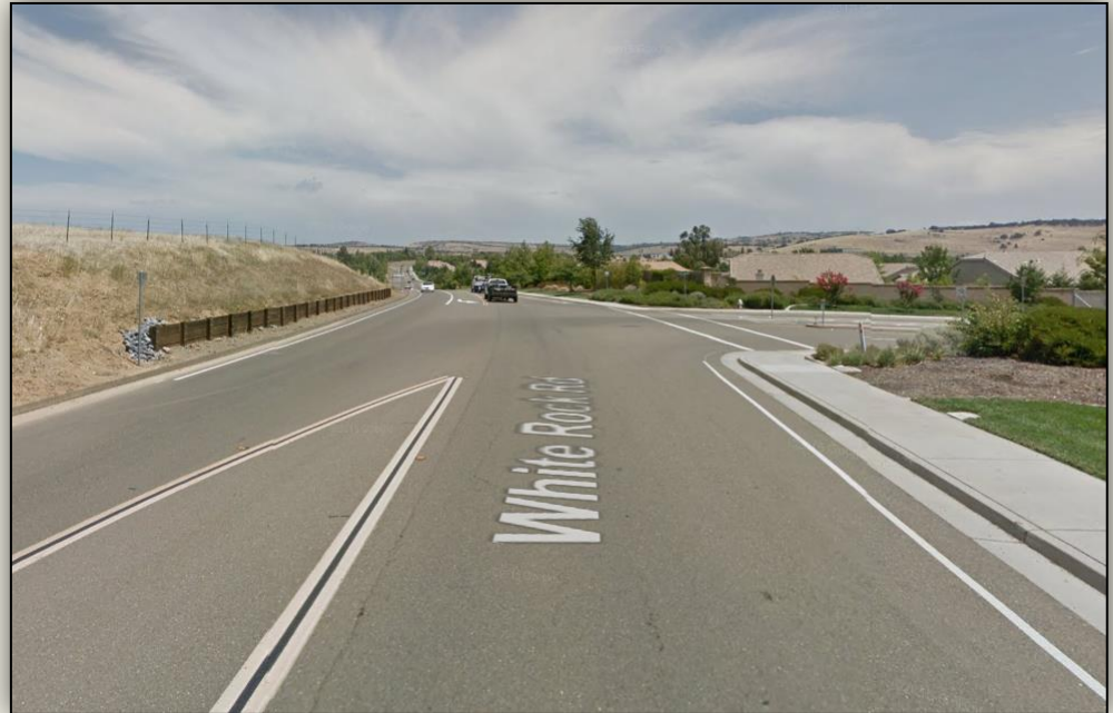
Existing Roadway Looking East at Carson Crossing Road