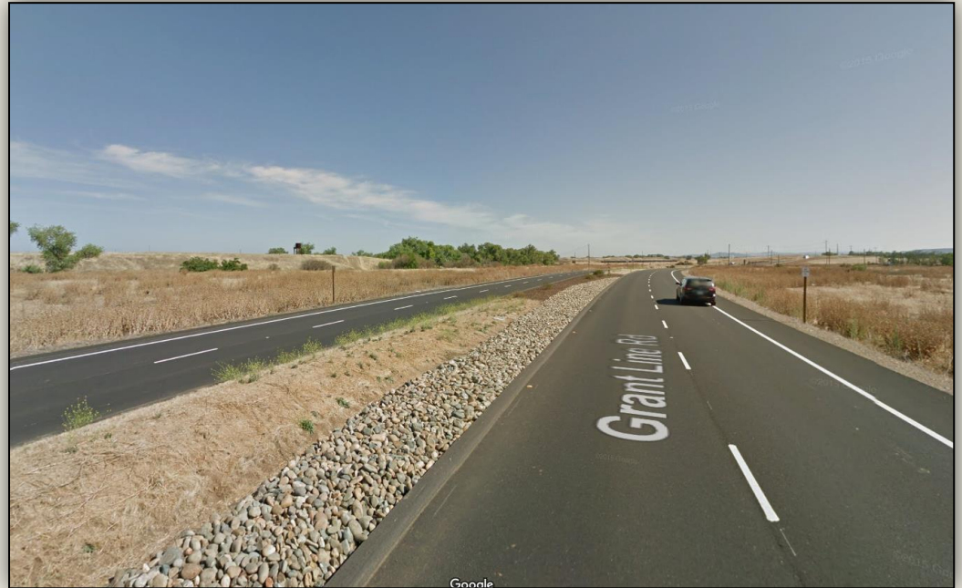
Current 4-lane section west of Prairie City Road in Sacramento County