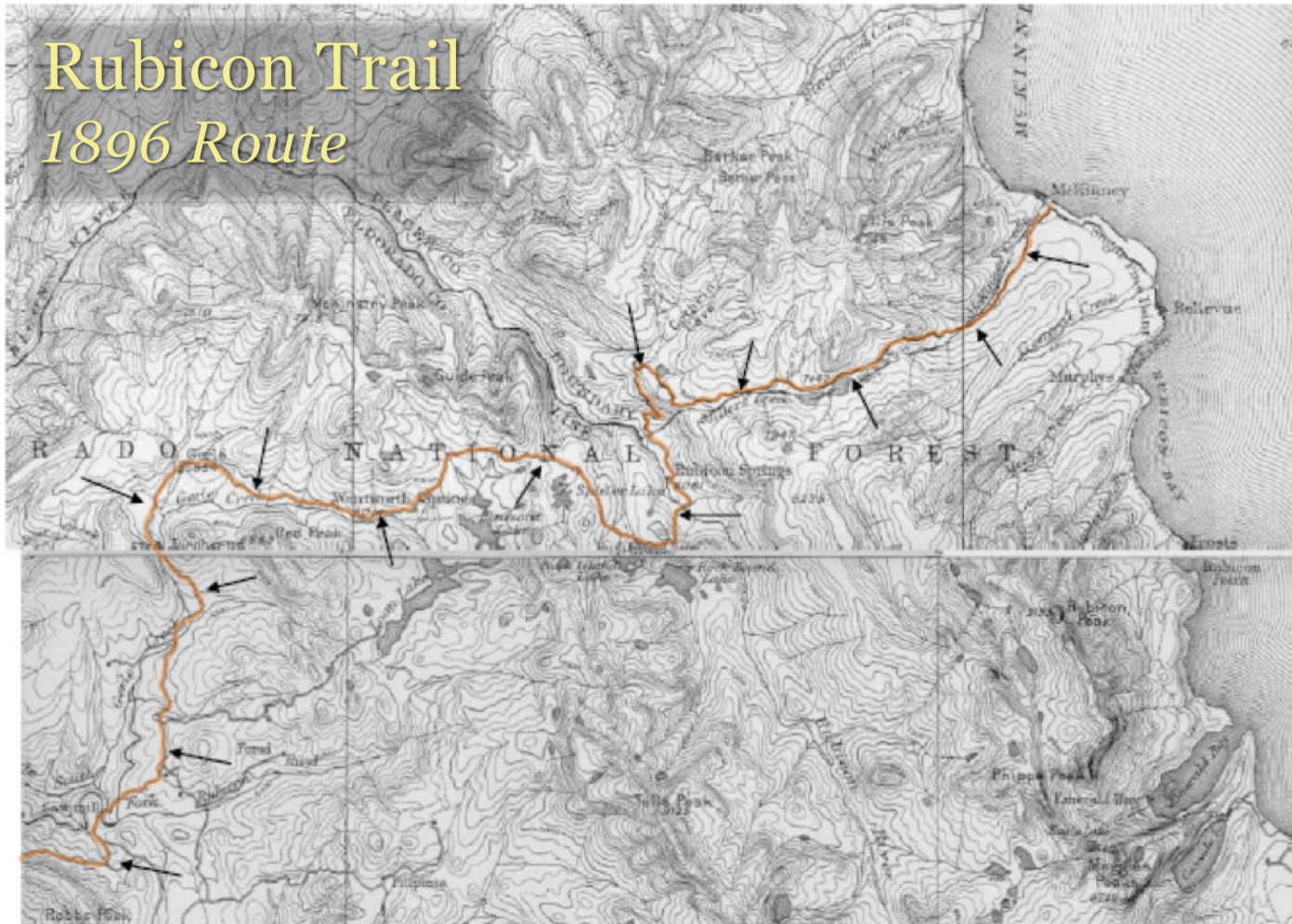
Location of portion of the wagon road shown on the 1896 editions of U.S. Geological Survey Pyramid Peak and Truckee California Map Sheets.