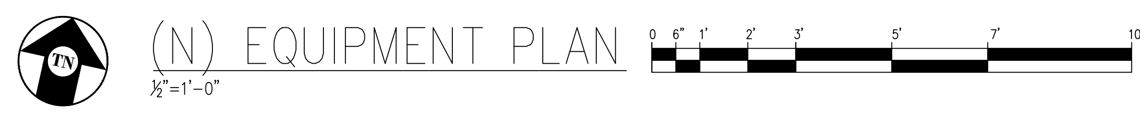
(N) EQUIPMENT PLAN

NOTICE NEW MONOPINE TO BE ANALYZED BY OTHERS. STREAMLINE ENGINEERING & DESIGN INC. IS NOT RESPONSIBLE FOR THE EVALUATION OF THE NEW MONOPINE, BASE PLATE, ANCHOR BOLTS, FOUNDATION OR ANTENNA/RRU MOUNT FRAMING & CONNECTIONS FOR NEW LOADING CONDITIONS.