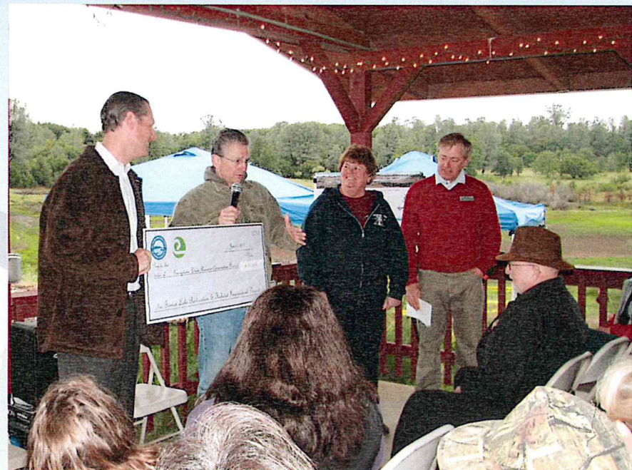
Finnon Lake Restoration and Habitat Improvement