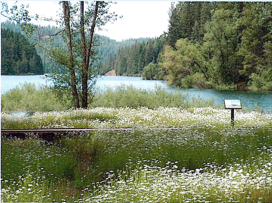
Hazel Meadow Habitat Restoration Project