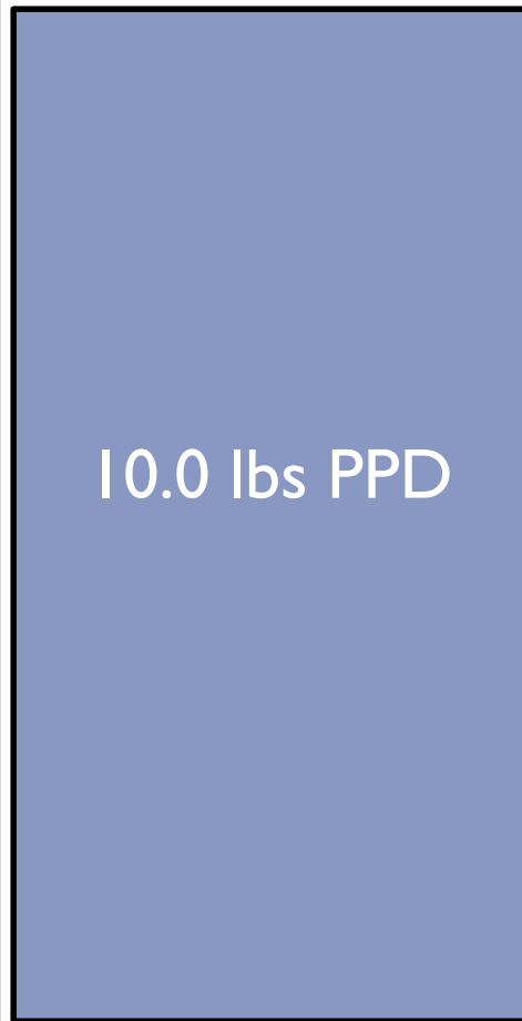
2006 Generation PPD

50% Equivalent Per Capita Disposal Target