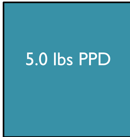
Pounds per Person per Day (PPD)

50% Equivalent Per Capita Disposal Target