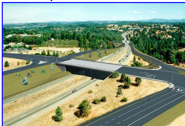
Click image to view larger