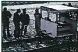
CP&LT Railroad No. 4 track inspection car on the Placerville Branch at El Dorado, Nov. 2008