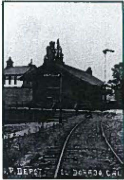
An early photograph of the El Dorado Depot with the school visible on the hill in the background. The El Dorado Community Hall is now located in the old school building. The plan would recreate the depot, loading platform and rail siding

The El Dorado County Historical Railroad Park will be a county museum facility where historical railroad artifacts are displayed and operated for the enjoyment and education of the public. It will be located in the town of El Dorado utilizing the existing Sacramento-Placerville Transportation Corridor (SPTC) right of way, located north of Pleasant Valley Road on Oriental Street.