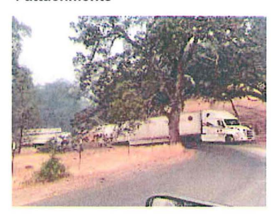
truck 2.jpg 3364K