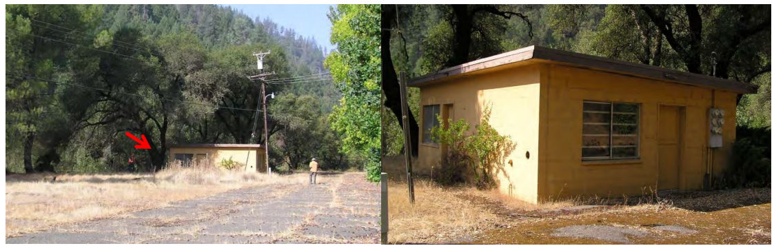
Figure 4 Restroom/Laundry Building