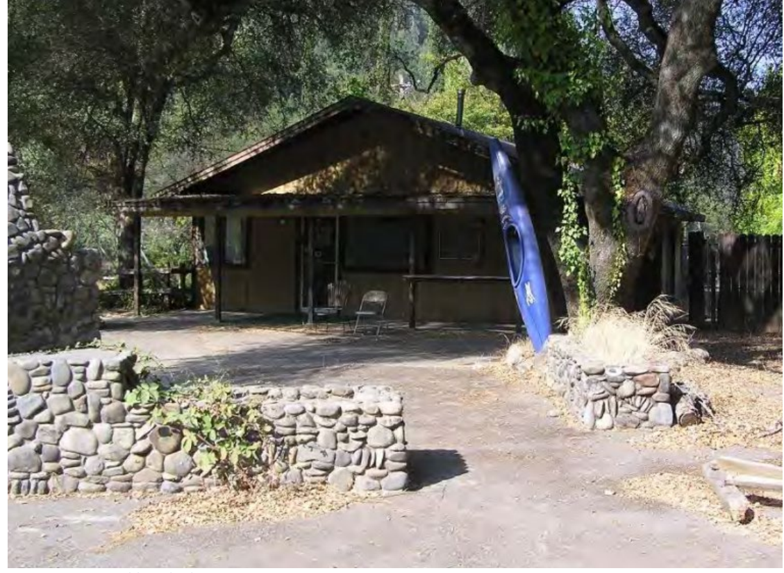
Figure 5 Store Building, looking West