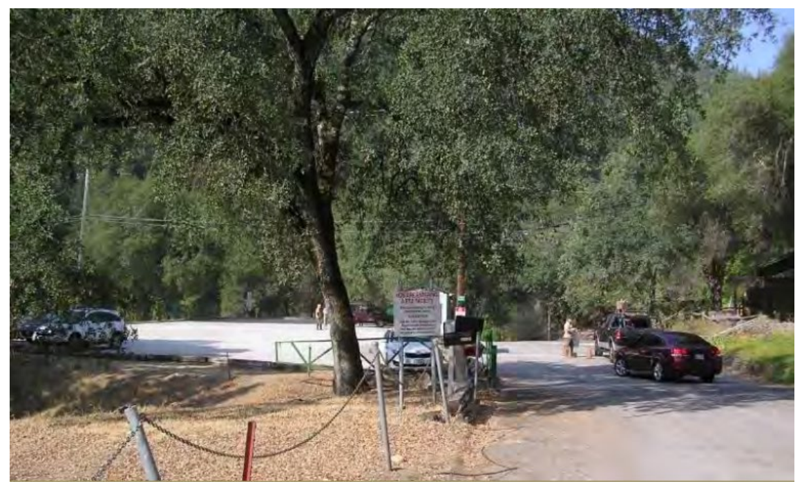
Figure 7 Kiosk and Upper Parking Lot view from Entrance

To the south of the subject area is Chili Bar Park, which is managed by ARC under a conservation easement and Management Agreement. The Park provides access to the American River via a shared driveway and a gravel loop road, which allows for river kayak and raft launch. Chili Bar Park is popular all year round for its river access, especially in the hotter months. The Park also features a lawn area with benches for viewing the American River, parking area, informational kiosk, bike racks, trash receptacles, interpretive signs, and portable restroom facilities. At the entry to the Park lies a large gravel parking lot, which is not part of the conservation easement. Currently, ARC leases this parking lot from the County for use by visitors. The parking lot also houses the ARC entry fee and informational kiosk.