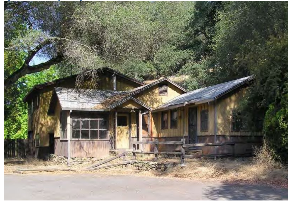
Figure 6 Residential Building, looking West