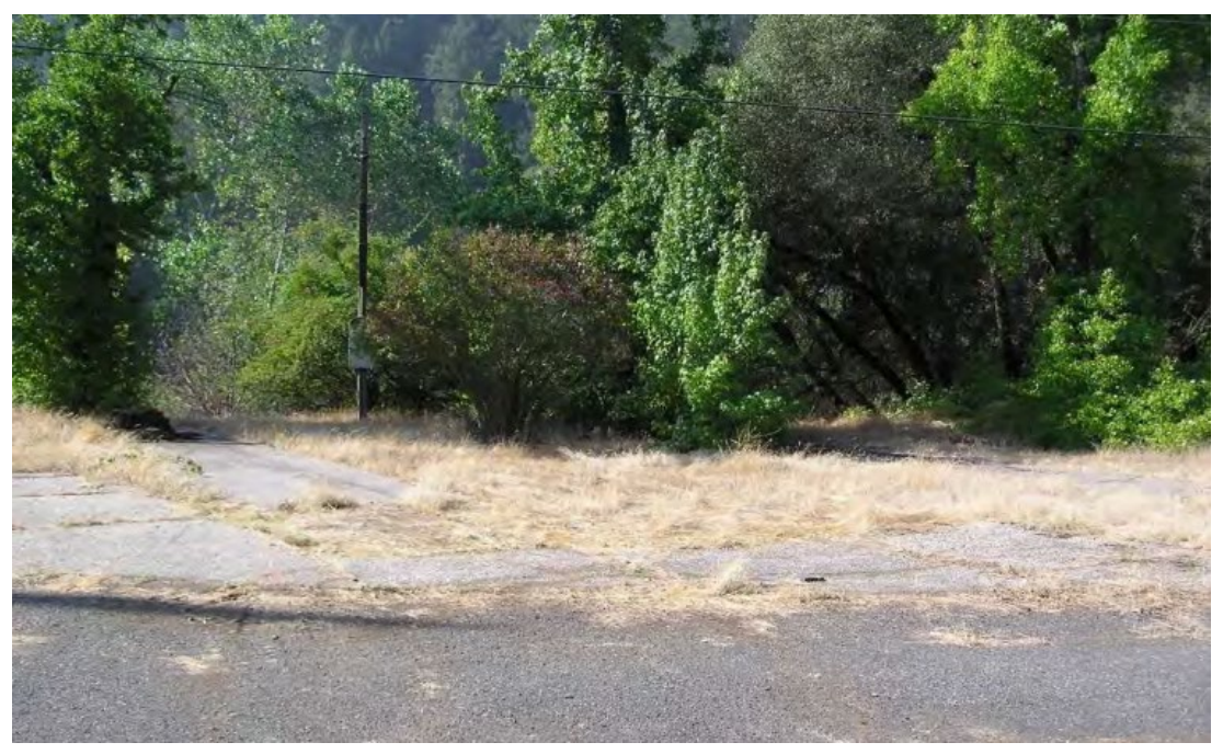
Figure 2 Mobile Home Concrete Pads, looking South

The mobile home park was developed in 1963. Sixteen concrete pads remain due to the removal of the old mobile homes, and one trailer remains to the far west of the area. The exact layout and composition of campsites would be determined by the Operator but could accommodate approximately nine RV campsites. Existing utility hook-ups to the campsites will likely be retained and modified as needed to serve the new campground. The existing mobile home will be demolished and removed, and this area could be used as a gathering space or for some other purpose. The mobile home area also contains a cinder block building that was previously used as a restroom and laundry facility. The existing restroom could be renovated to provide a public restroom, laundry facilities, etc. A steep stairway down from the upper terrace leads to White Water Lane to the south and to Chili Bar Park and river access.