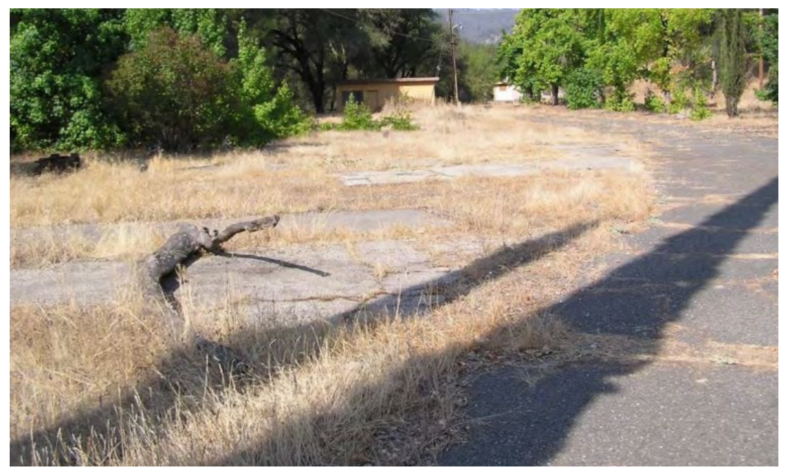
Figure 3 Mobile Home Concrete Pads, with Restroom/Laundry and Remaining Mobile Home in Background