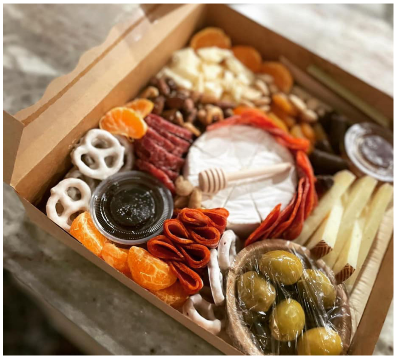
22-2088 B 7 of 19