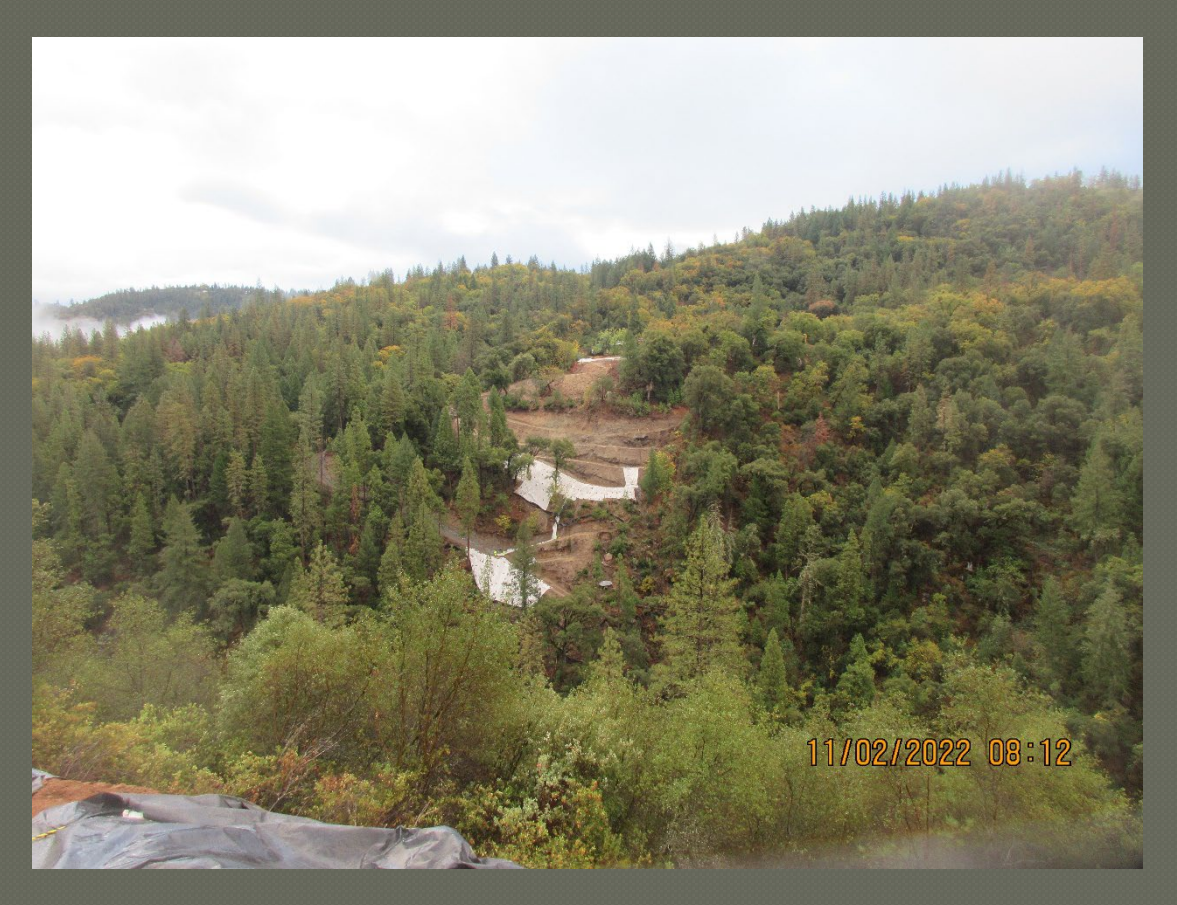
View Looking South from North Side