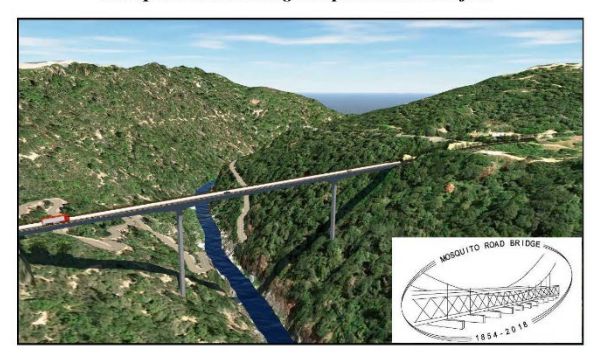
Mosquito Road Bridge Replacement Project