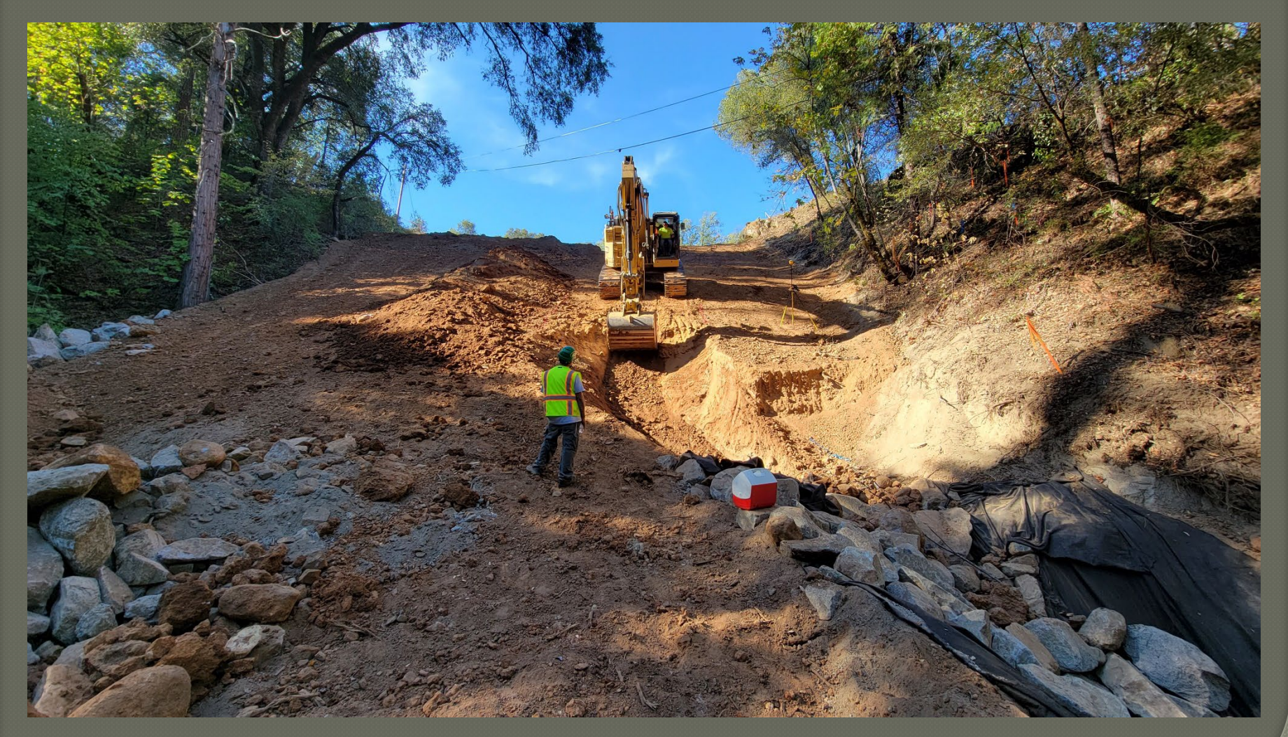
Drainage System #3 Rock Lined Ditch at South Approach