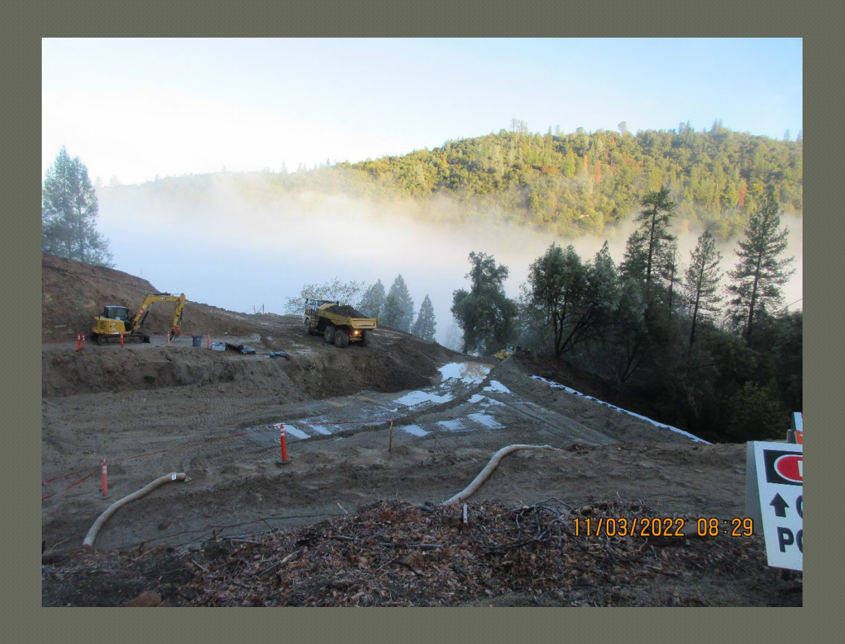
View Looking North from South Side