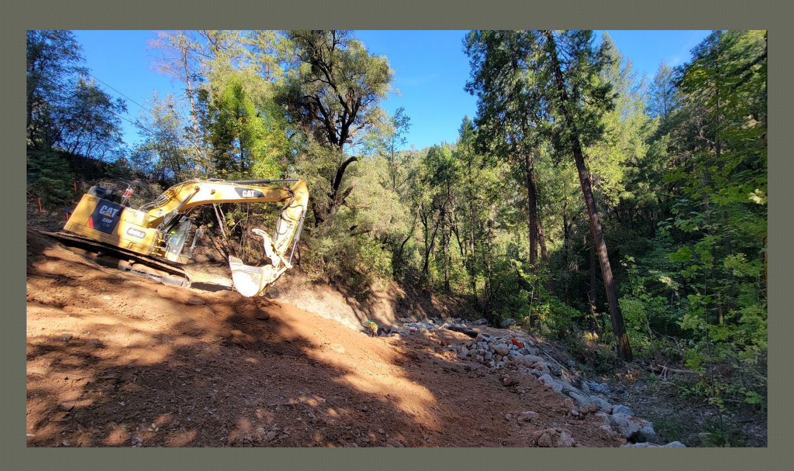
Drainage System #3 Rock Lined Ditch at South Approach