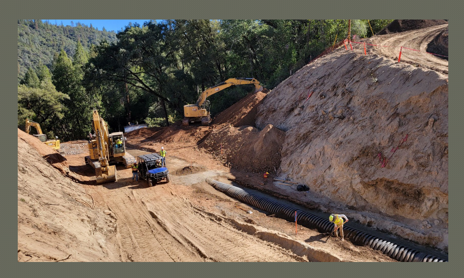
Drainage System #3 48" Pipe at South Approach