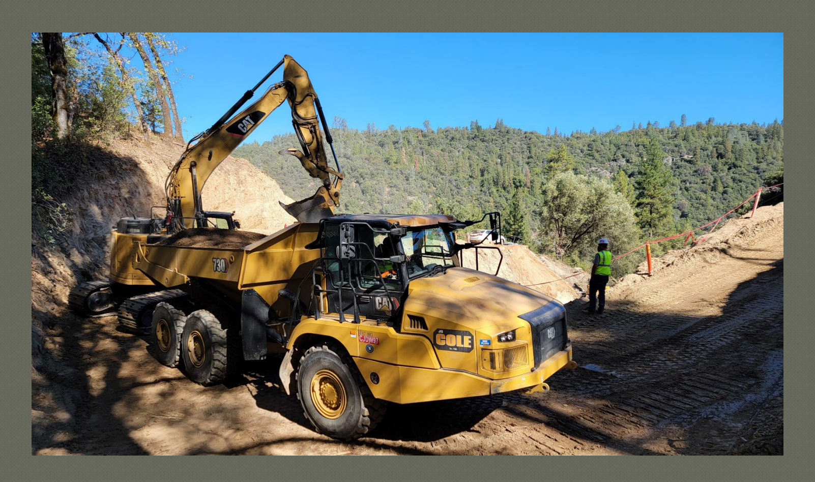
Construction Access Road at South Approach