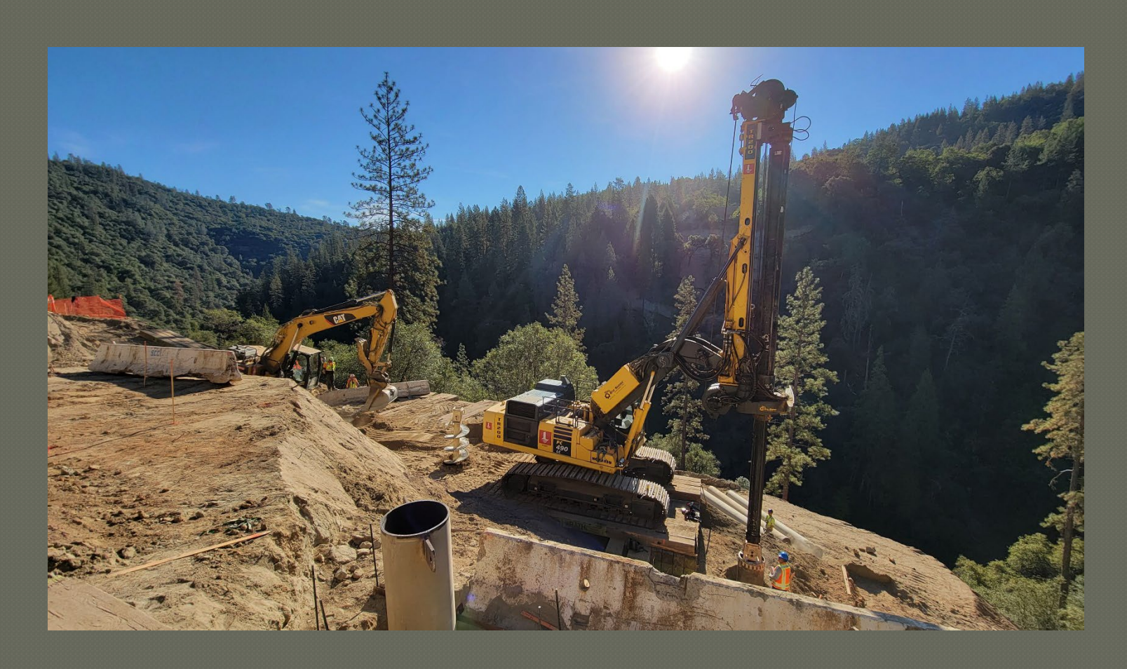
Drilling Foundations for Trestle at North Side