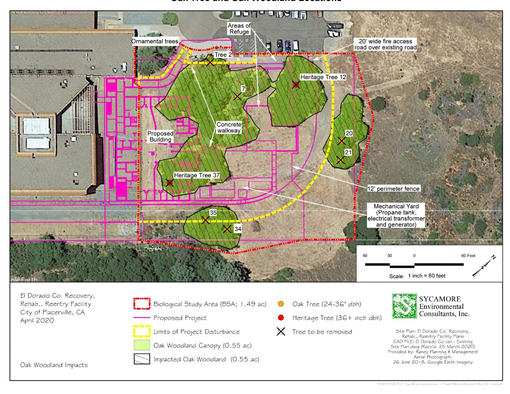
Figure 3 Oak Tree and Oak Woodland Locations