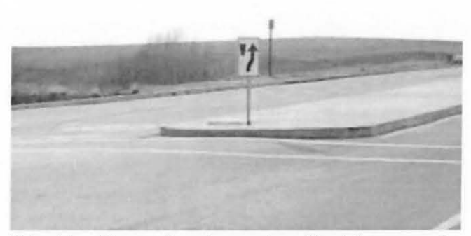
Palmdale - Carson Crossing west median (sign present)