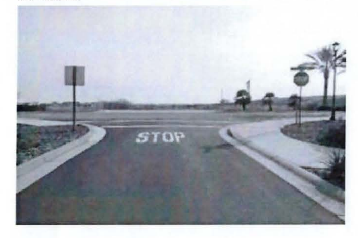
Mission Canyon (south)