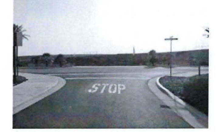
Mission Canyon (south)