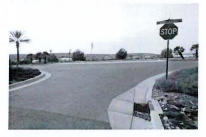
De La Vina