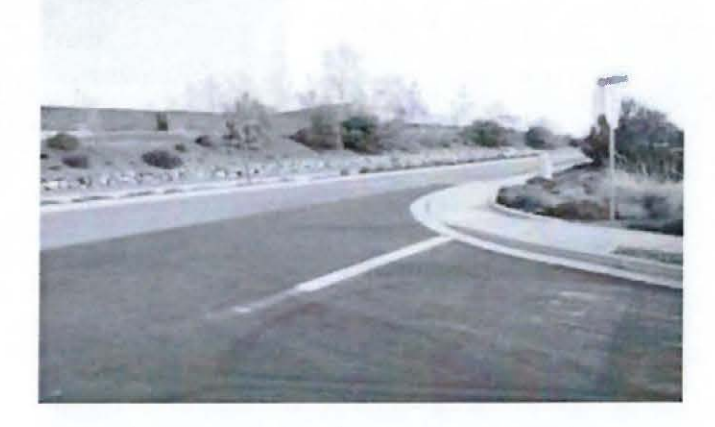
De La Vina - Carson Crossing EVA (damaged sign)