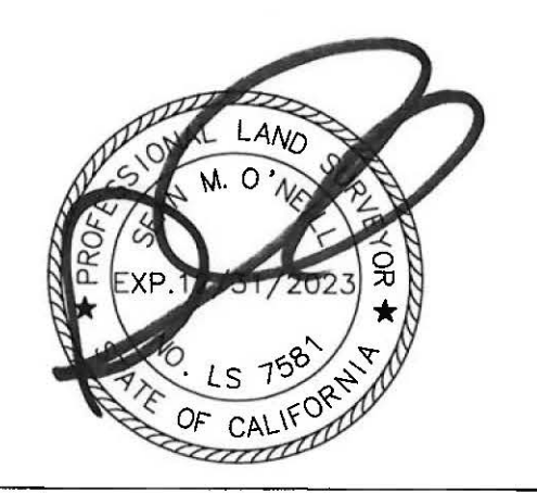
EXHIBIT B GENESIS CIVIL ENGINEERS

960 McCOURTNEY RD, STE. C GRASS VALLEY, CALIFORNIA 95949 (530) 742-1300