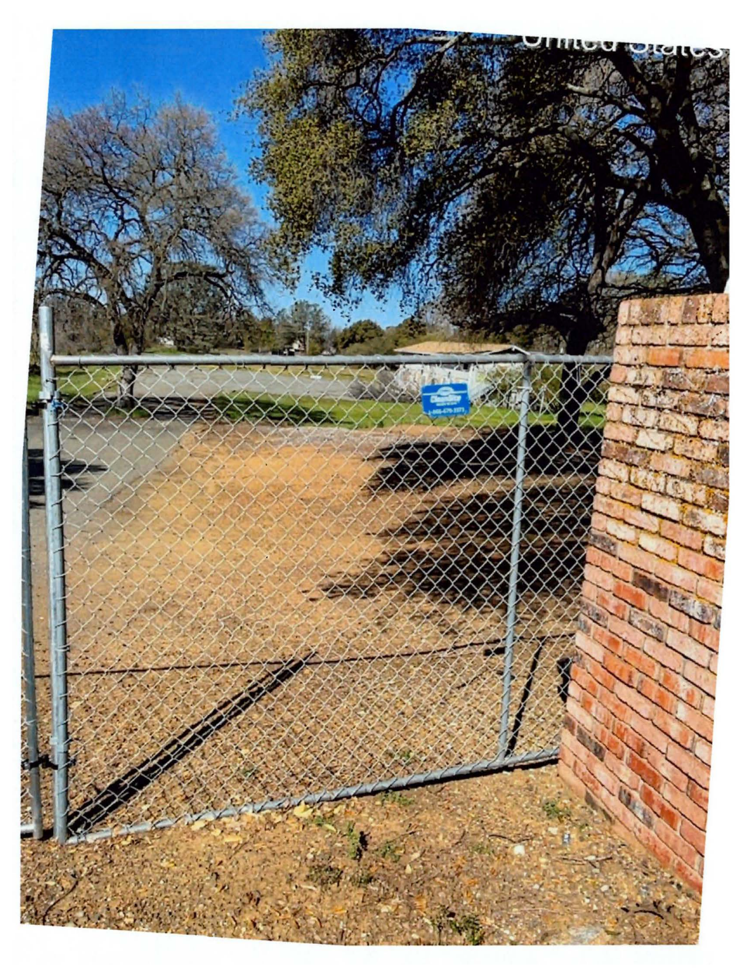
23-0739 Public Comment PC Rcvd 04-20-23