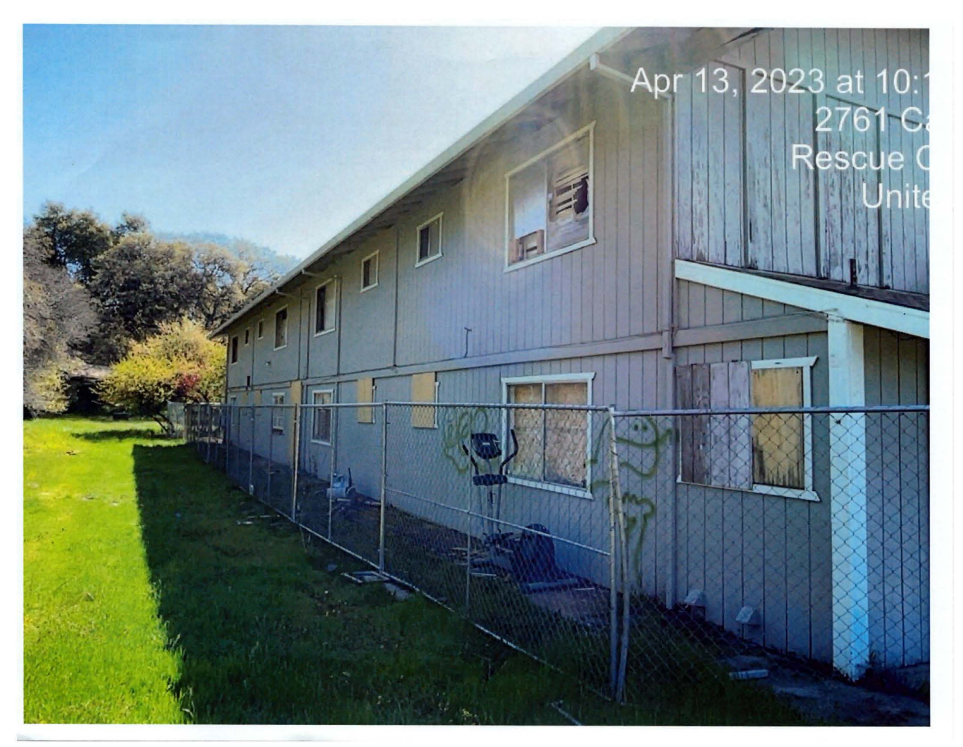
23-0739 Public Comment PC Rcvd 04-20-23