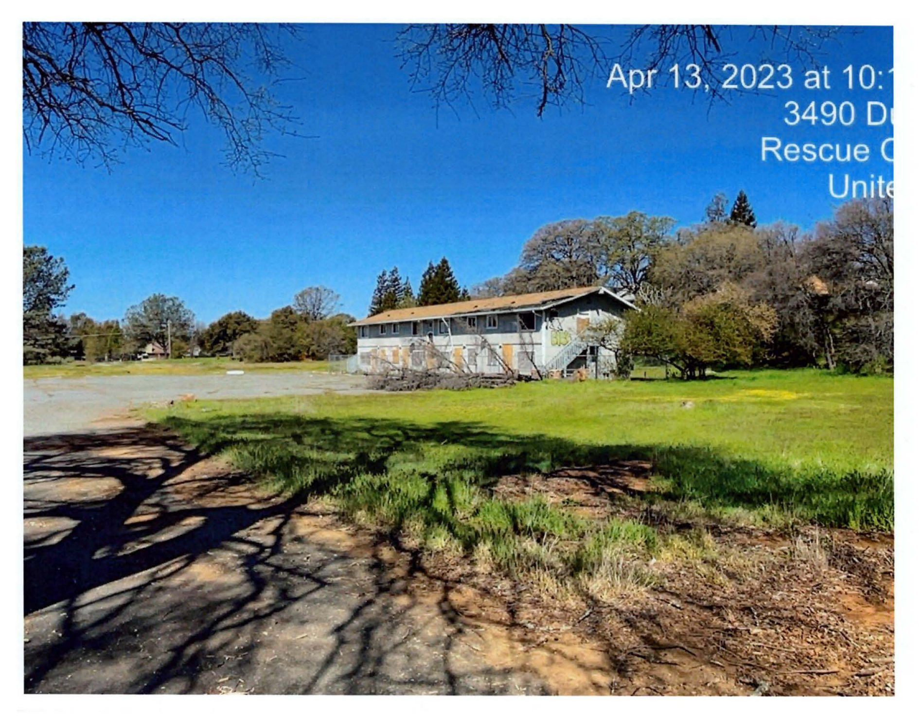
23-0739 Public Comment PC Rcvd 04-20-23