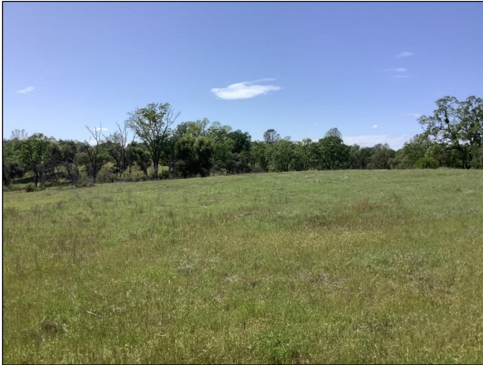
Figure 4. Survey Conditions in Southeastern Portion of Project Area