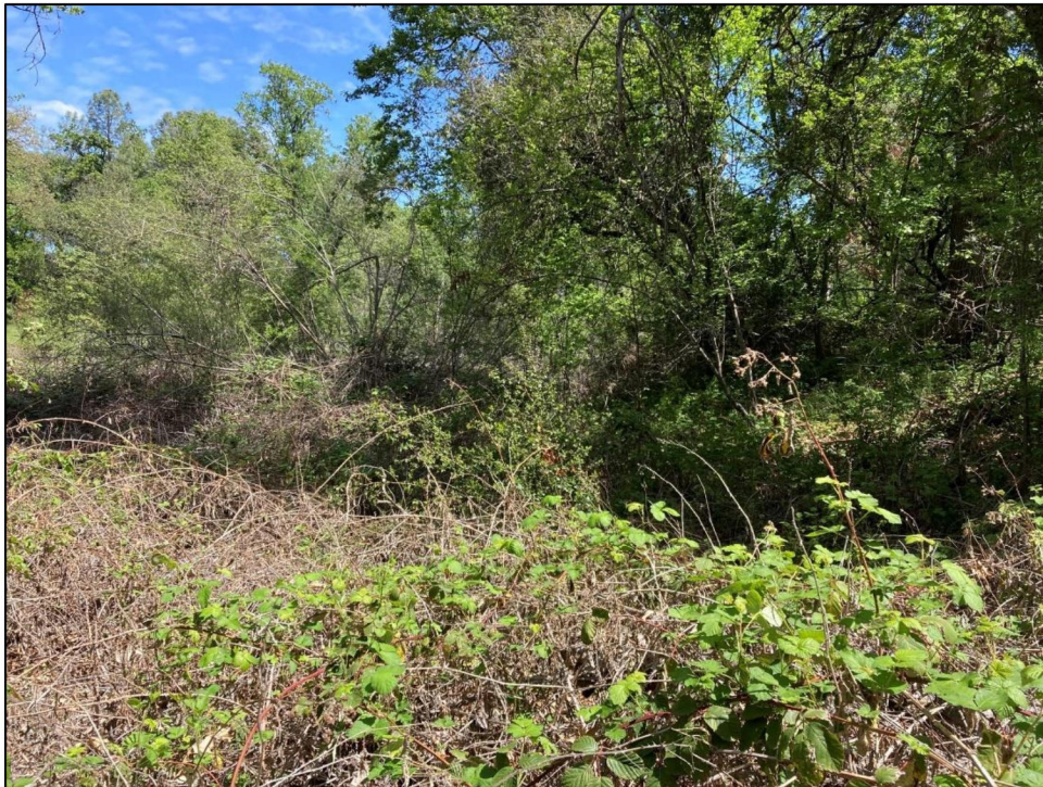
Figure 3. Survey Conditions in Northeastern Portion of Project Area

The three previously recorded resources were relocated during survey and one previously unrecorded historic-era resource was discovered and recorded during pedestrian survey. All of the previously recorded sites were remapped due to misplotted site locations, and additional features were recorded at P-09-001857 and P-09-001882. The previously undiscovered site consists of a historic-era earthen berm or dam. See the following sections for specific discussion of each resource.