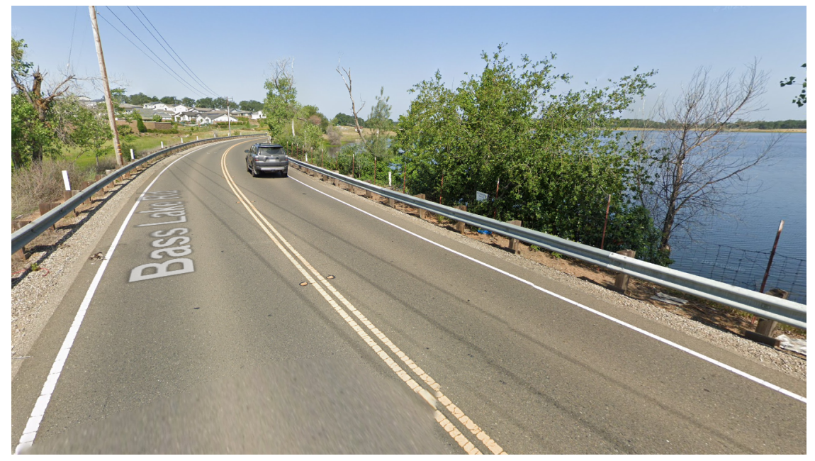
Sightline on southbound Bass Lake Rd a few hundred feet east of the Whistling Way intersection.

Rd at the Bass Lake Overflow, preventing motorists from seeing southbound traffic stopped for a left turn movement onto Whistling Way.