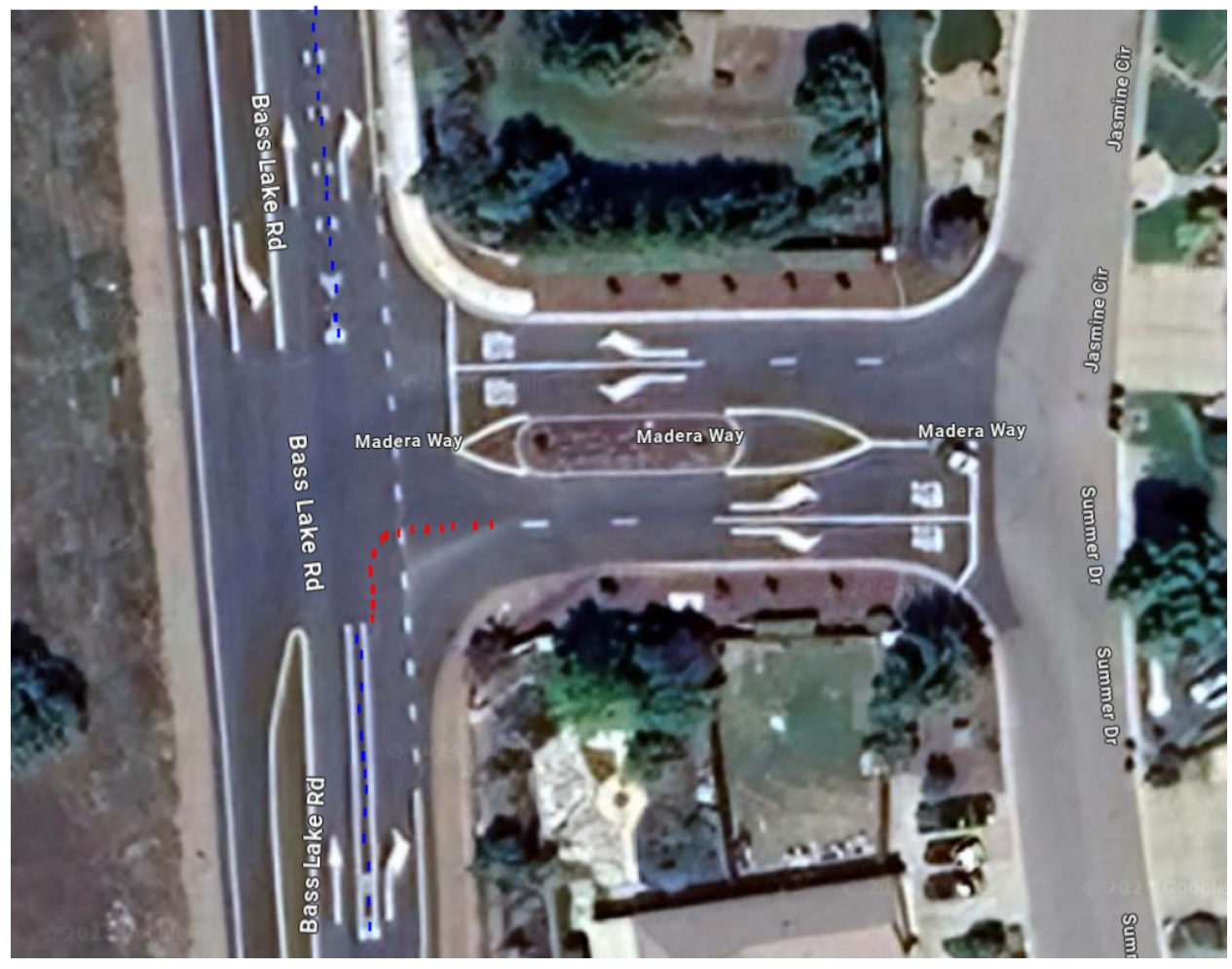
Bicycle lane denoted with BLUE dots - suggestion to 'close' the Madera Way turn pocket with road paint in RED dots

Bass Lake residents believe that the simplest solution is <u>signage designating the Madera Way turn pocket</u> as a right turn ONLY for Madera Way, along with paint on the roadway that "closes" the turn pocket to continuation/thru traffic.