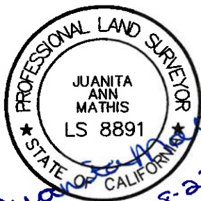
EXHIBIT 'B' EASEMENT ABANDONMENT

A PORTION OF SECTIONS 2, T12N, R9E, MDM EL DORADO COUNTY, CALIFORNIA SCALE: 1" = 40' DECEMBER, 2023