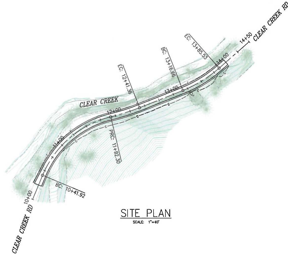
SITE PLAN SCALE: 1"=40'

To be supplemented with Standard Plans and Specifications dated 2018, including the 2018 Revised Standard Specifications, of the California Department of Transportation, unless otherwise noted.