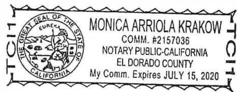
Notary Public Seal