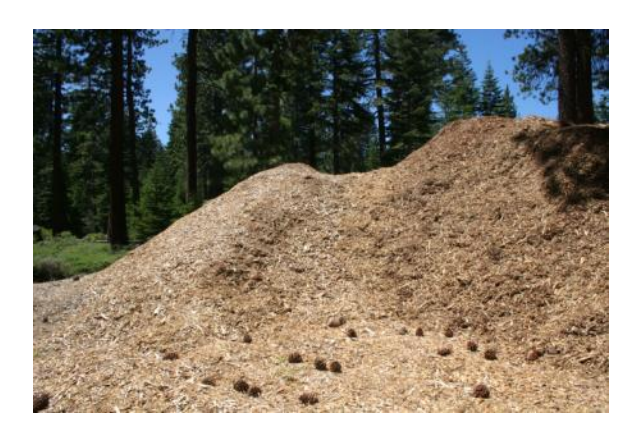
Regional biomass collection