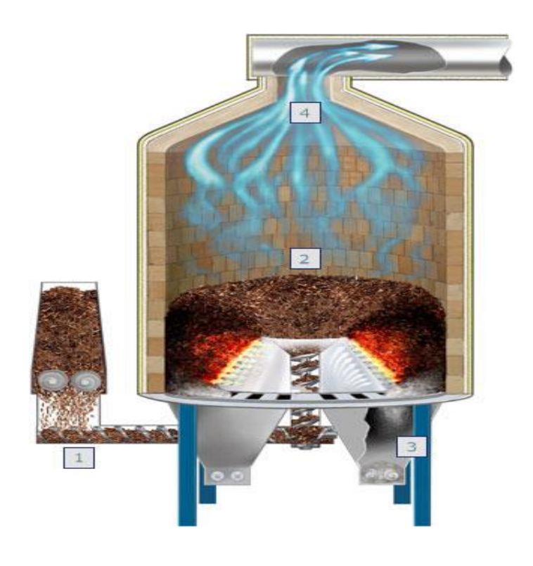
Gasification Unit (Nexterra)