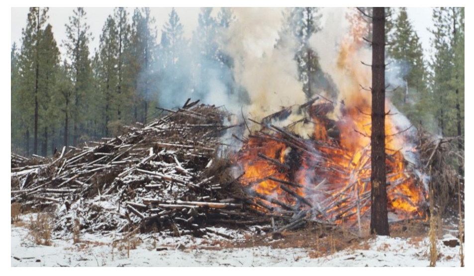
Large amounts of Air Emissions