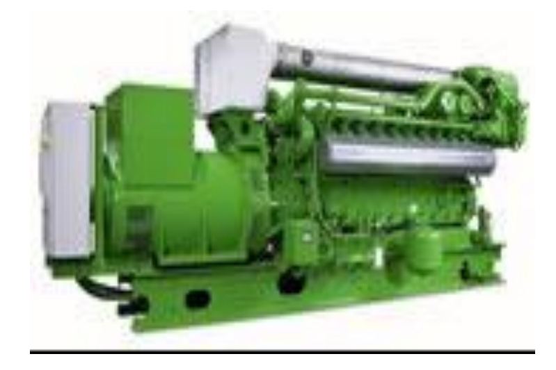
Internal Combustion Engine Coupled with a Generator (GE Jenbacher)