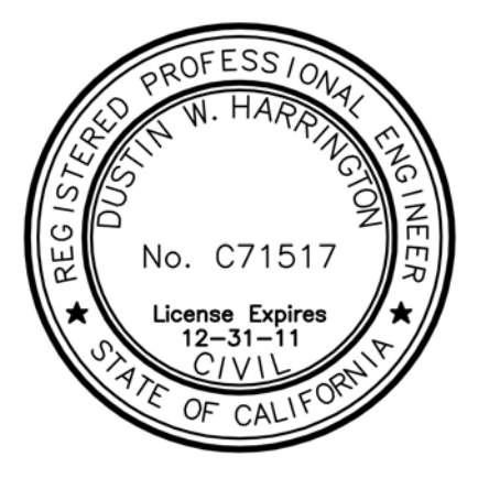
Registered Civil Engineer

The various portions of the Contract Documents have been prepared under the direction of the following licensed Civil Engineer, in accordance with California Business and Professions Code § 6735.