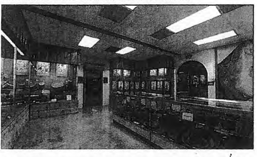
Click image above to tour the Tulare County Museum's Native American basket collection.

*Museum fees are included in the Mooney Grove Park admission fees.