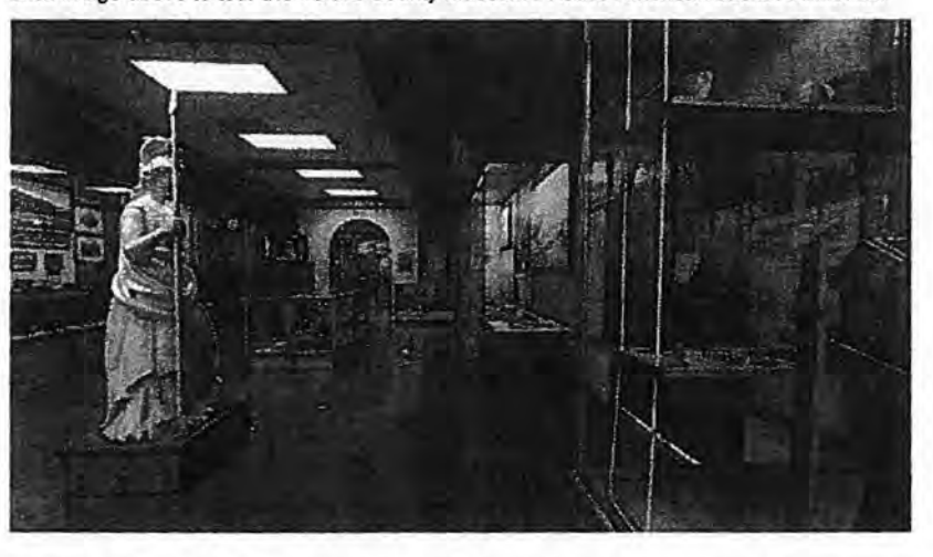
Click image above to tour exhibits in the Tulare County Museum's main gallery.