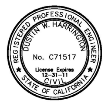
Registered Civil Engineer