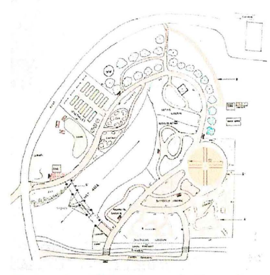
Each garden will highlight sustainable practices.

The Master Gardener Demonstration Garden is located at 6699 Campus Drive, off Missouri Flat Road in Placerville, directly behind the El Dorado Center/Folsom Lake College, on property owned by the El Dorado County Office of Education. We are thrilled to be partnering with EDCOE, Folsom Lake College/El Dorado and the Cameron Park Rotary, who built and manage the adjacent Community Observatory.