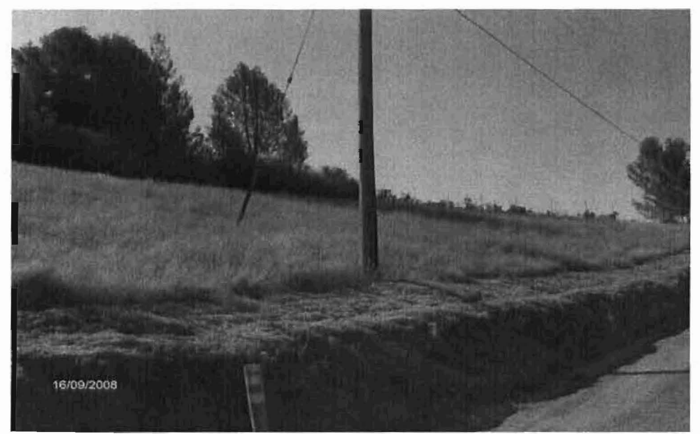
Above: triangular area between subject parcel and Gopher Hole Rd.