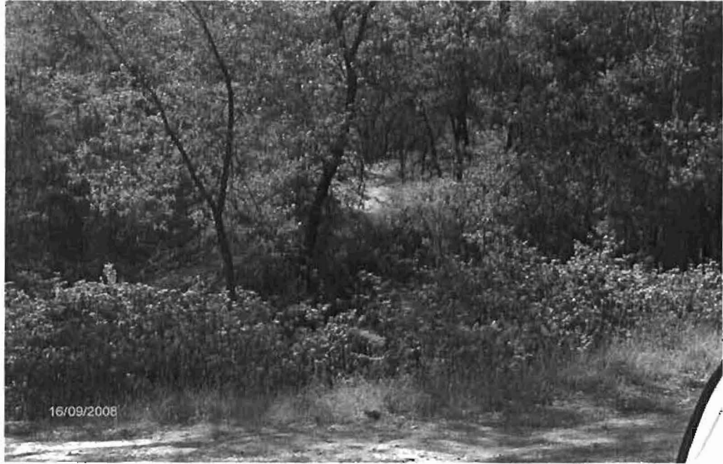
Above: driveway to 2020 South Moonshadow taken from South Moonshadow Ln.