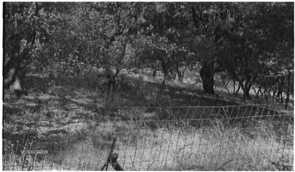
Above and below: area west of S. Moonshadow Ln and adjacent to subject parcel.