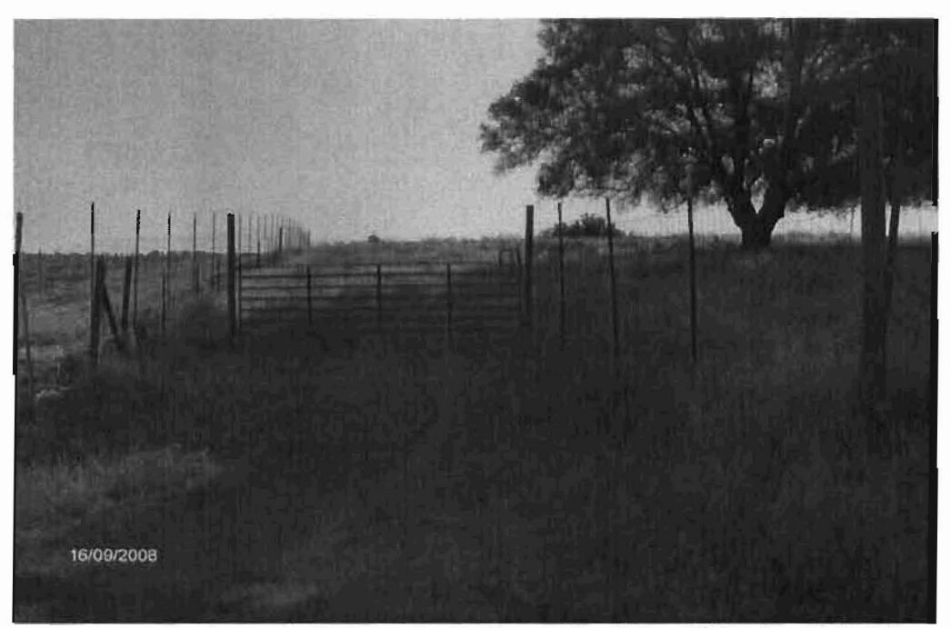
Above: portion of parcel adjacent to subject parcel and east of Gopher Hole Rd.