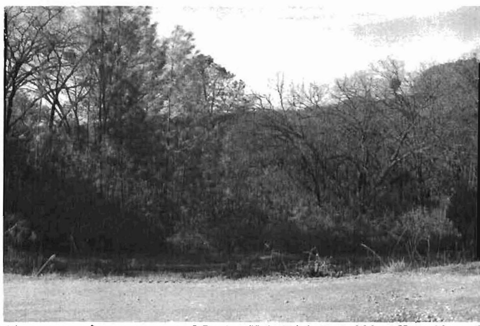
Above: area of property west of Gopher Hole Rd that would be affected by setback.