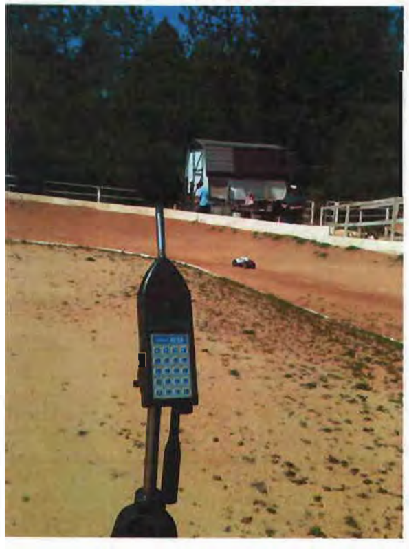
Figure 3 – Southern Racetrack Area

Environmental Noise Analysis RCC Racetrack – Rescue, California (El Dorado County) Page 3