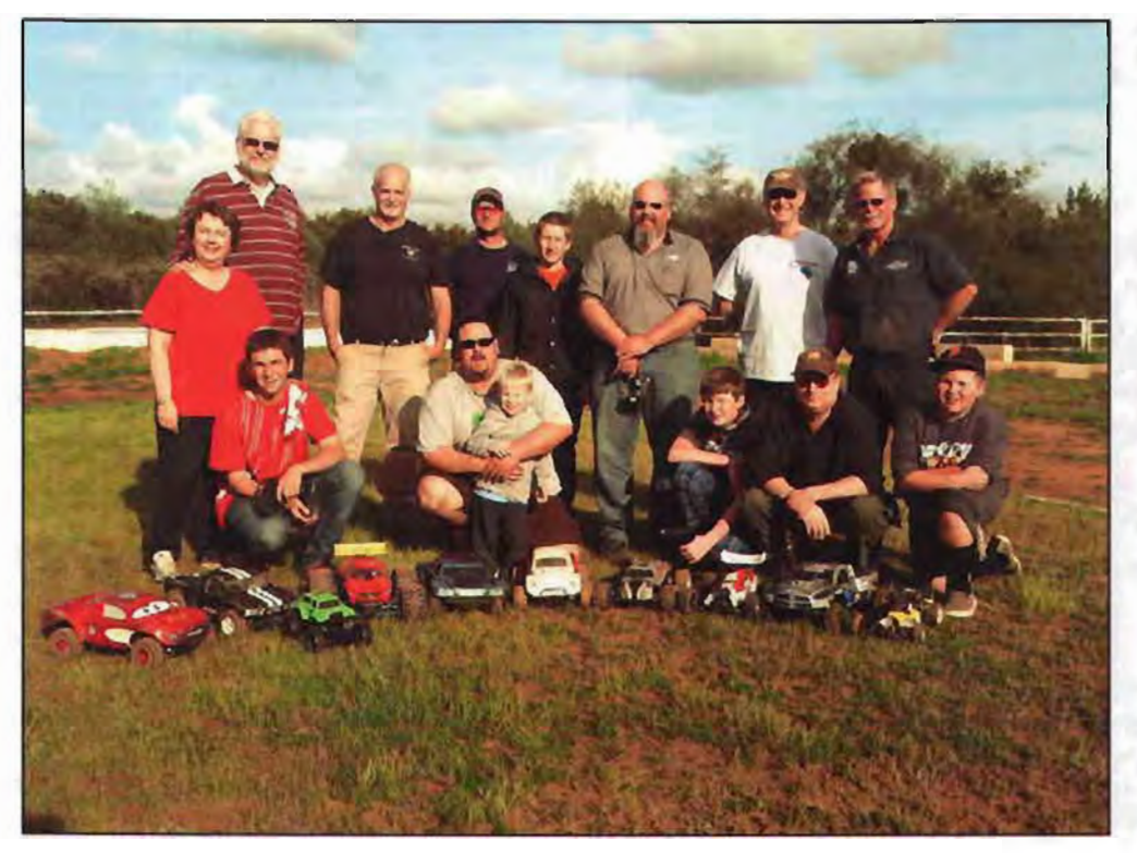
Figure 4 – Electric Cars Monitored during April 6, 2013 Noise Survey

Environmental Noise Analysis RCC Racetrack – Rescue, California (El Dorado County) Page 5