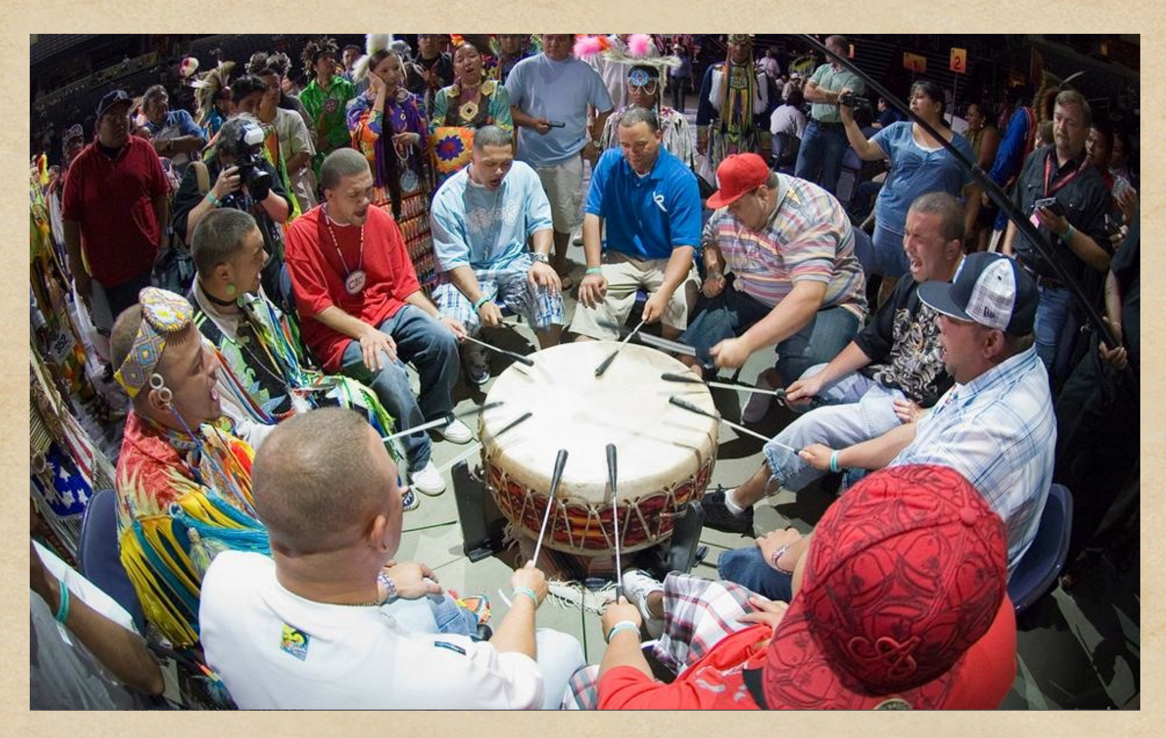
The drum is the heart beat of the pow wow.