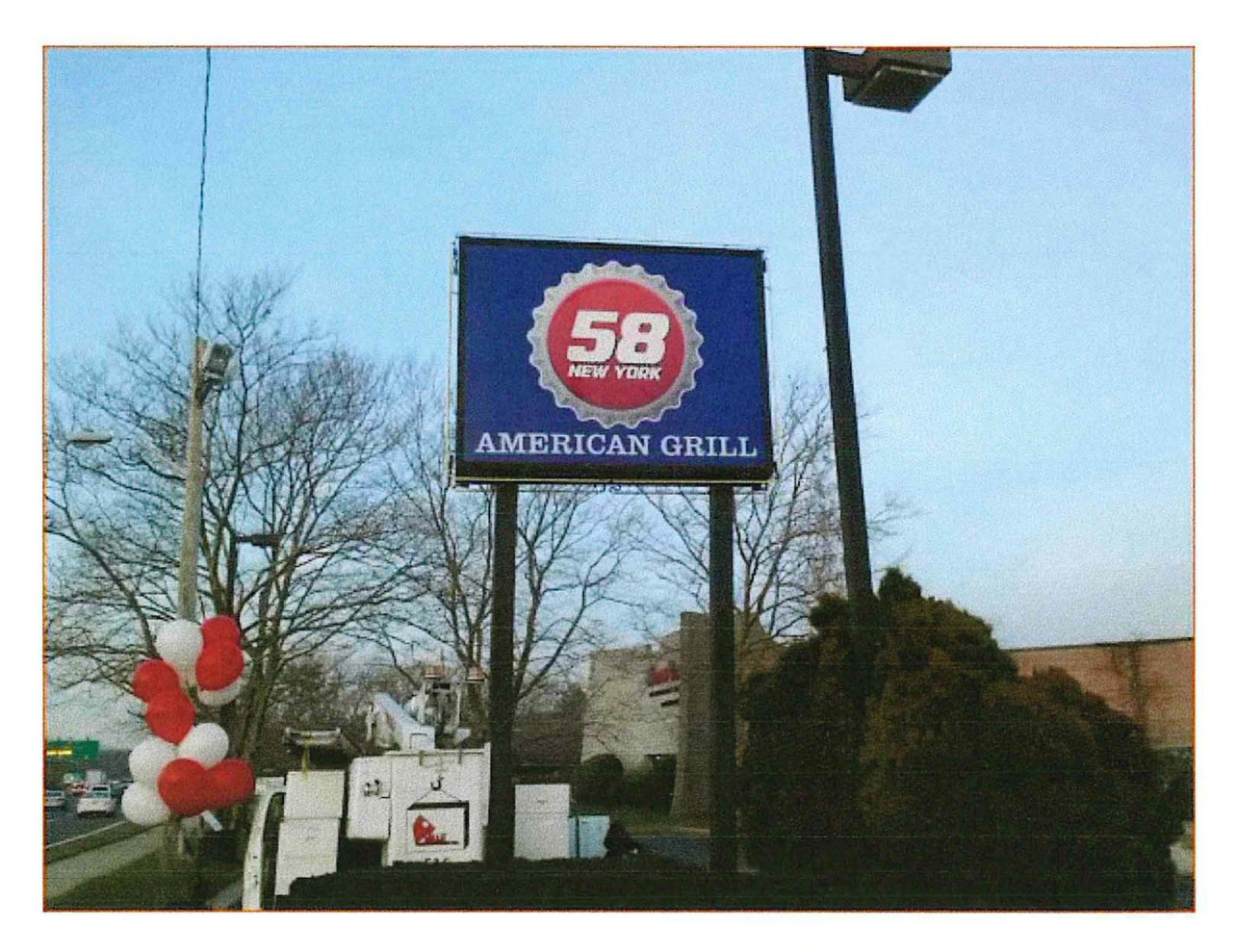
IN THE SPRING AND SUMMER, THE TREES WILL HAVE LEAVES THAT BLOCK THE SIGN.