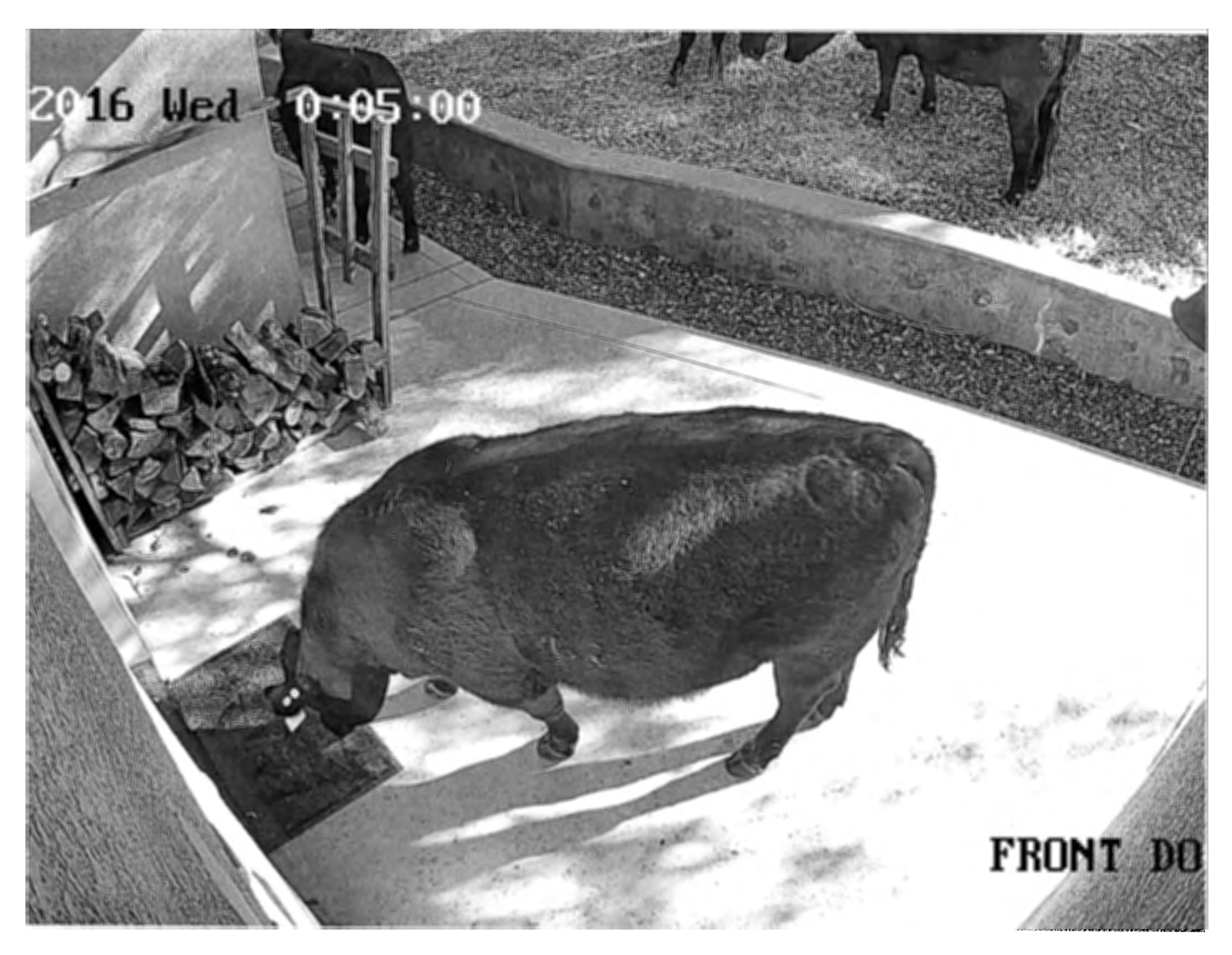
07-1802 Public Comment PC Rcvd 06-06-16 #2