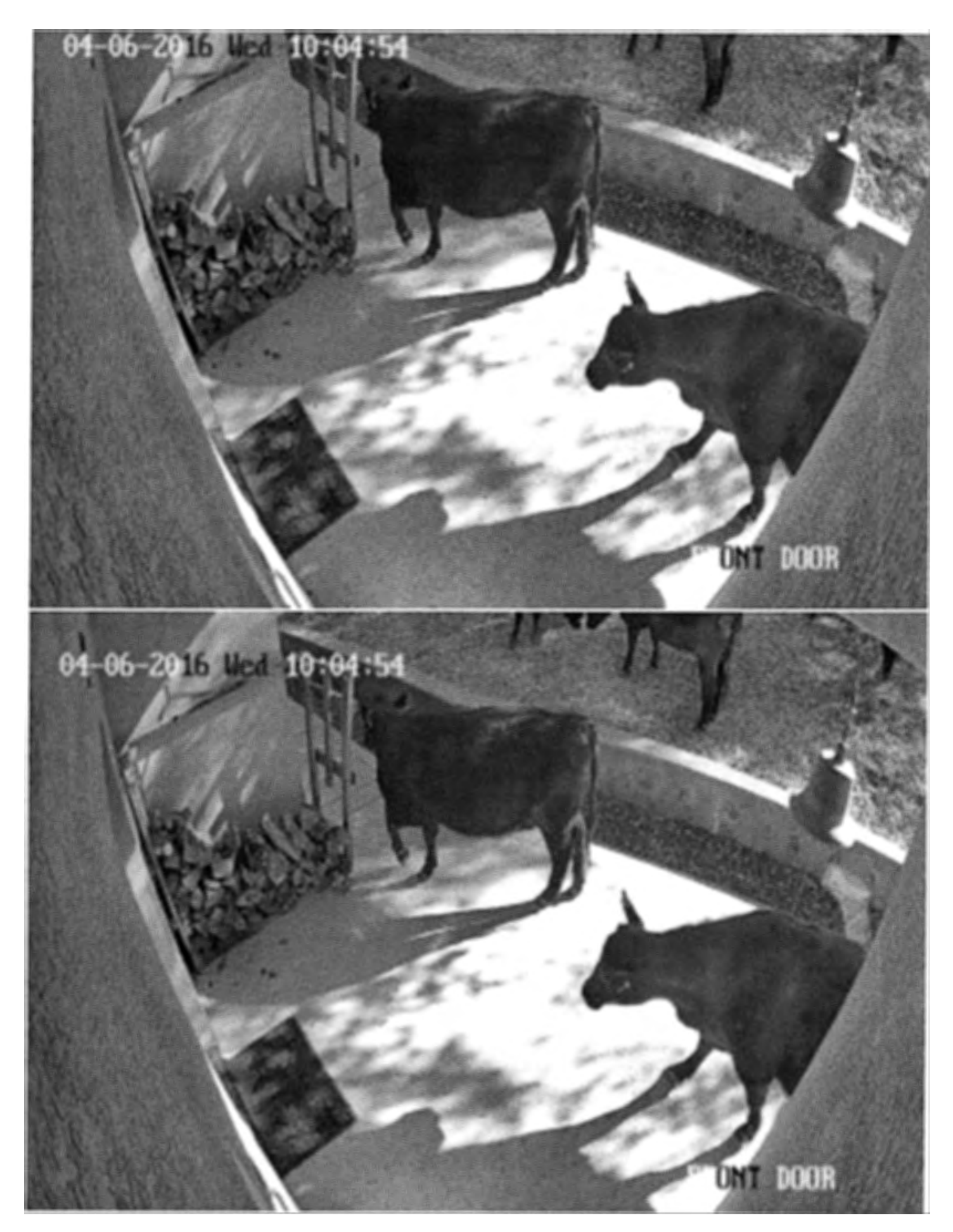
07-1802 Public Comment PC Rcvd 06-06-16 #2