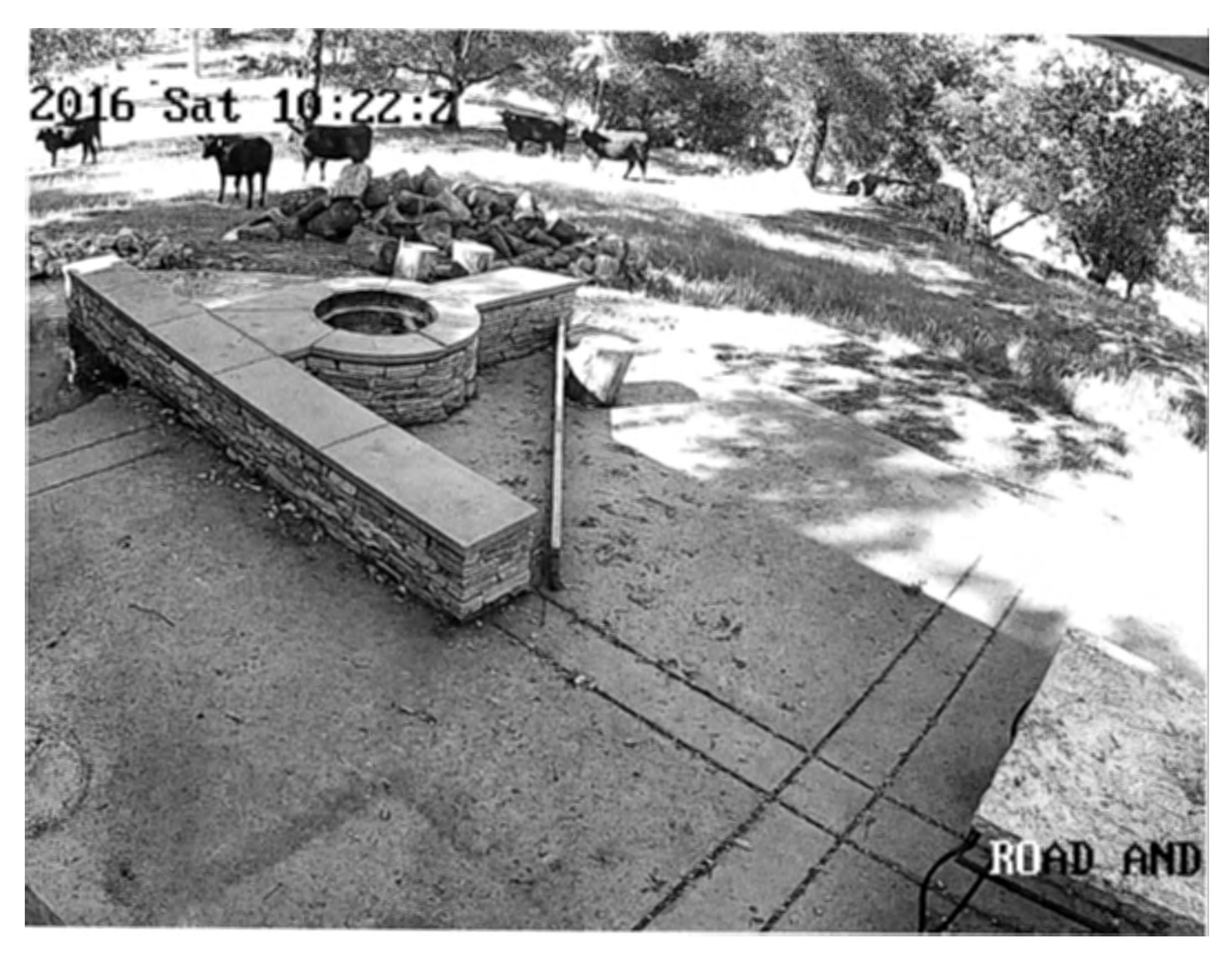
07-1802 Public Comment PC Rcvd 06-06-16 #2