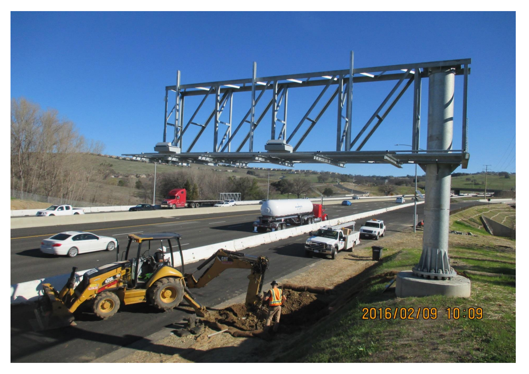
Where Are Your Impact Fees Going? 16-0846 E 1 of 7